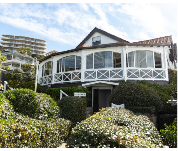
Figure 2: View towards the subject site from the Undercliff Reserve.