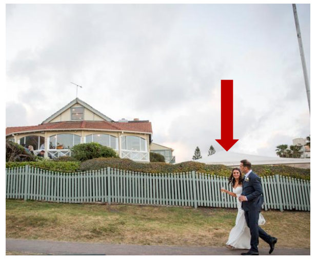
Figure 5: View towards the subject site from the Undercliff Reserve showing the 'Pilu Pavilion' in the indicated.