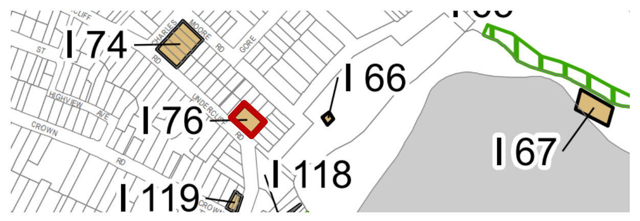
Figure 17 - Extract of heritage map with the subject site outlined in red.

A building with great social & historical significance as an early meeting place & recreation venue for the first settlers in Freshwater. Representative of the federation style, with high integrity. Prominent local landmark located above Freshwater Beach.<sup>2</sup>