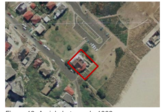
Figure 13: Aerial photograph, 1982.