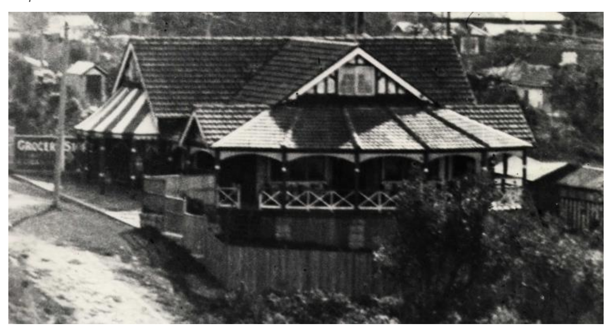
Figure 8 – Kiosk, the Restaurant Harbord, c1918.