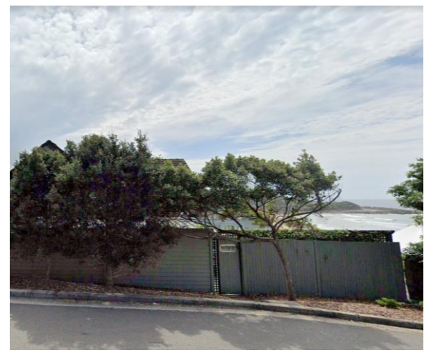
Figure 1: View towards the subject site from Undercliff Road.

The 'Pilu Pavilion' is located on the northeast corner of the site and the "Wedding Ceremony Umbrella" is located within the garden to the east of the primary building. They are both located within the garden setting below the level of the principal house and its verandah. The 'Pilu Pavilion' is a lightweight structure that features a low hipped roof form. Large picture windows provide protection from the elements, whilst allowing it to be read as an open marquee-like structure. The "Wedding Ceremony Umbrella" is a canvas umbrella shade structure with a central pole.