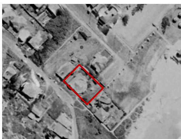
Figure 10: Aerial photograph, 1955.