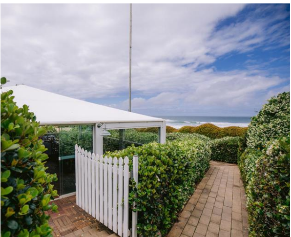
Figure 4: View towards the 'Pilu Pavilion' in its garden setting.