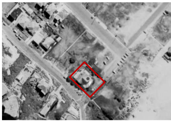
Figure 12: Aerial photograph, 1978.