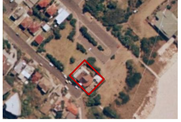
Figure 14: Aerial photograph, 1991. Note: first evidence of the 'Pilu Pavilion' being constructed on the subject site in the eastern corner of the site.