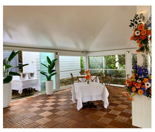
Figure 6: Internal view of the 'Pilu Pavilion'.