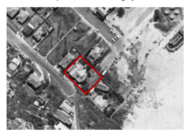
Figure 11: Aerial photograph, 1965.