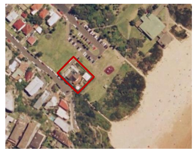
Figure 15: Aerial photograph, 2005. Note: first evidence that the 'Wedding Ceremony Umbrella' structure had been installed.