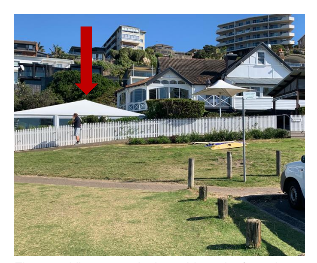
Figure 3: View towards the subject site from the Undercliff Reserve showing the 'Pilu Pavilion' in the indicated.