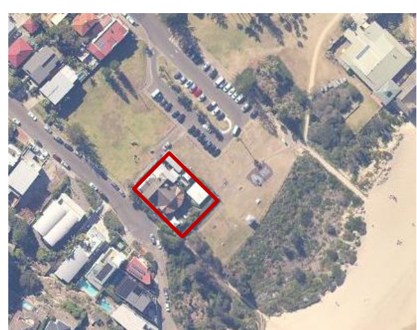
Figure 16: Aerial photograph, 2023. Source: NSW Spatial, Historical Imagery.

Source: NSW Spatial, Historical Imagery.