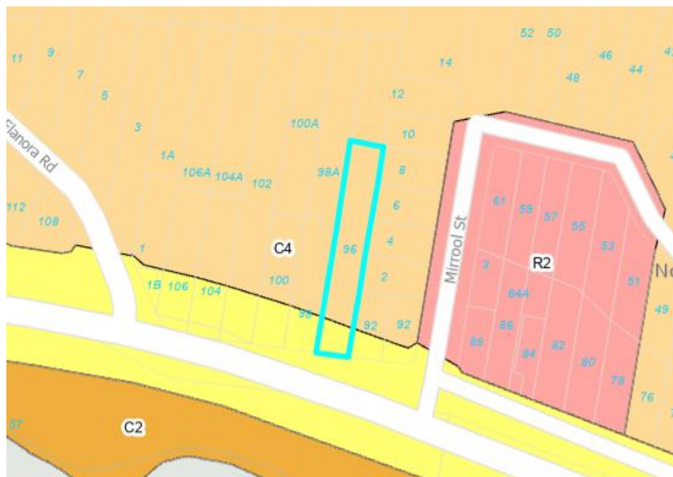
Fig 6: Extract of Pittwater Local Environmental Plan 2014

The site is zoned C4 Environmental Living and SP2 Infrastructure under the provisions of the PLEP 2014.