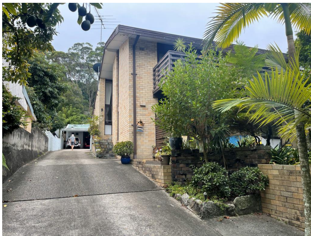
Fig 3: View of the existing southern dwelling, looking north towards rear dwelling