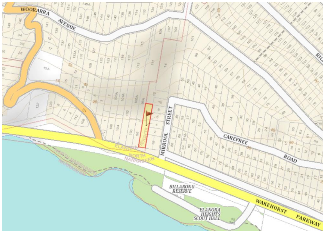
Fig 1: Location of subject site

The details of the site are included on the survey plan prepared [insert] which accompanies the DA submission.