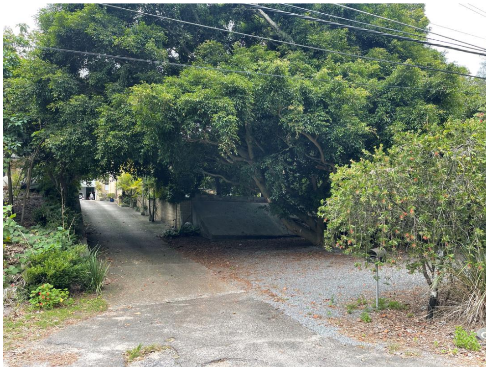
Fig 2: View of the site, looking north from Wakehurst Parkway