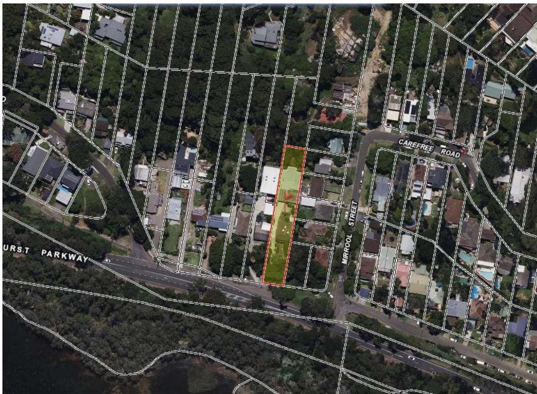
Fig 4: Aerial view of locality

There are also a number of community and recreational open space areas nearby, including Bilarong Reserve, and Narrabeen Beach.