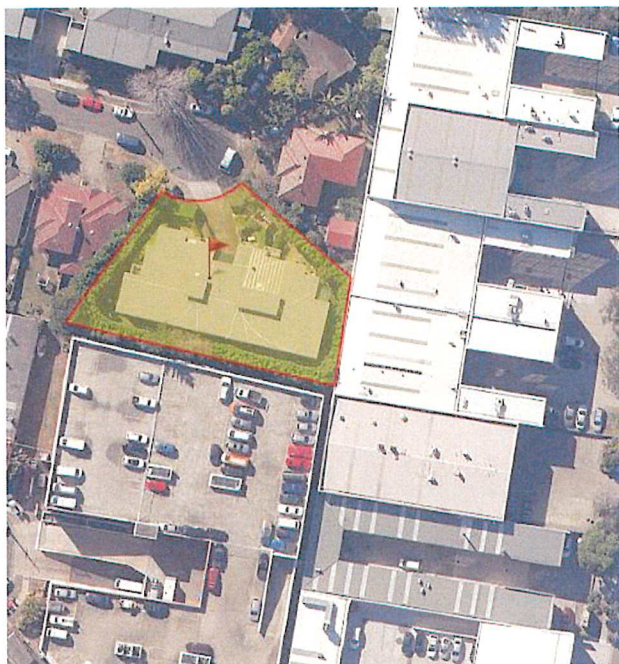
6-7 Funda Place, Brookvale