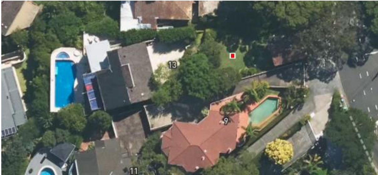
Figure 1: The subject site located by red marker.