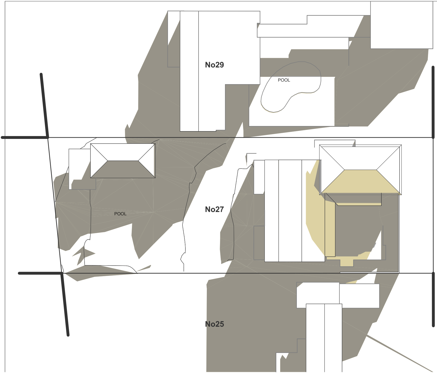
21ST JUNE - 3 PM