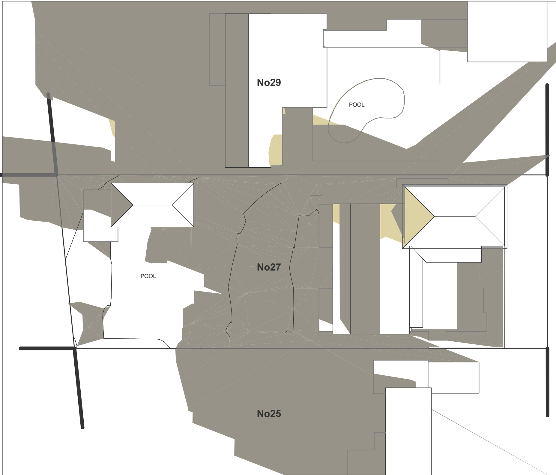
21ST JUNE - 9 AM