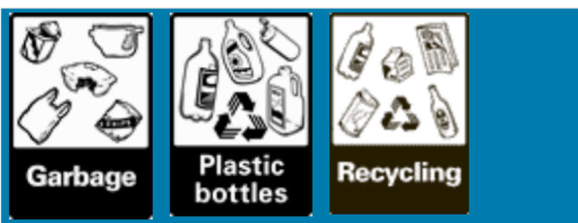
Figure I1.1: Examples of waste wall posters

The Planet Ark website also has resources available free of charge for use by businesses and councils. These signs can be found at <u>businessrecycling.com.au/research/signage.cfm</u>