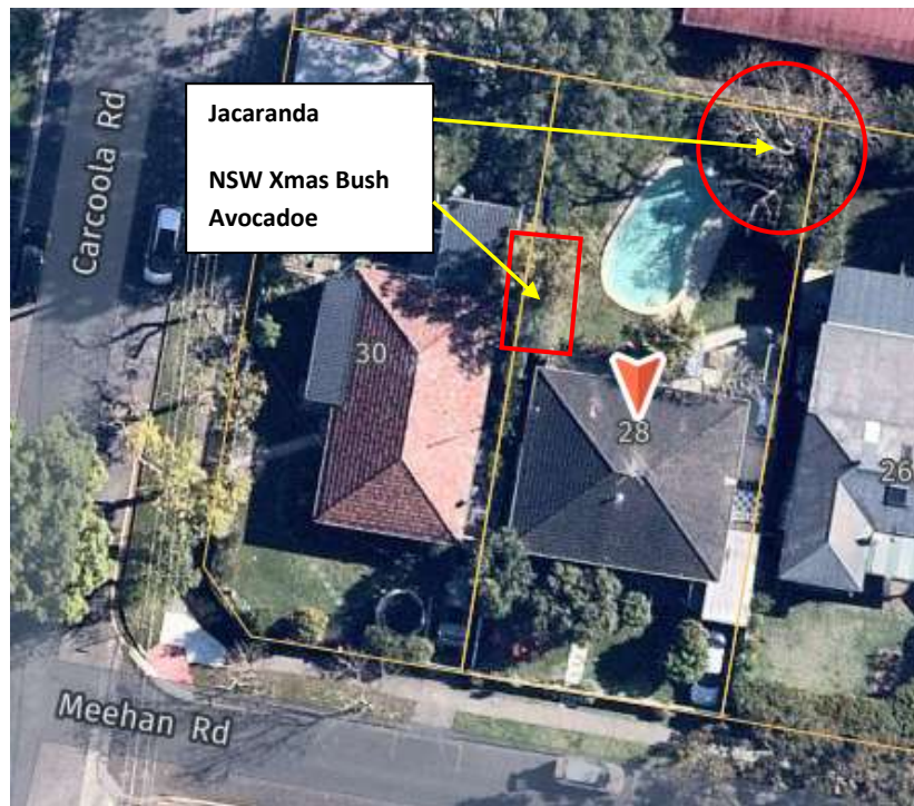
Figure 1: Above confirms tree/s presence in October 2021 & again in January 2022.

The below aerial photographs, courtesy of Nearmap™ website tool dated, Monday, 4 October 2021 & Saturday 29 January 2022, confirm our onsite observations & the existence of the now removed two (2) trees on Mondy, 4 October 2021.