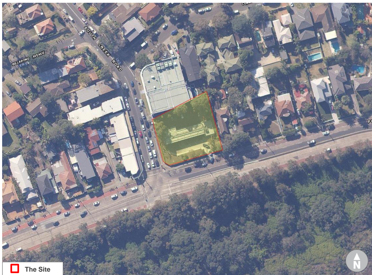
Figure 1 – The Site

The site is irregular in shape, has a total site area of 1,858sqm and contains two street frontages. These comprise a street frontage onto Pittwater Road to the south and a street frontage onto South Creek Road to the west. An aerial image of the site is provided in Figure 1 below.