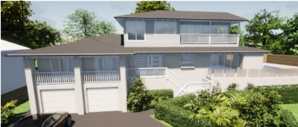
Proposed Streetscape elevation