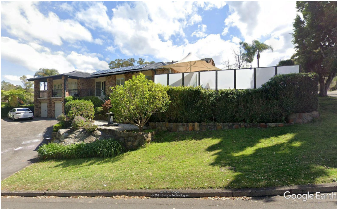
View of the existing dwelling from the street corner.

The building is not listed under the Warringah Local Environmental Plan 2011 as having any heritage significance nor is it in the immediate vicinity of any items of heritage significance.