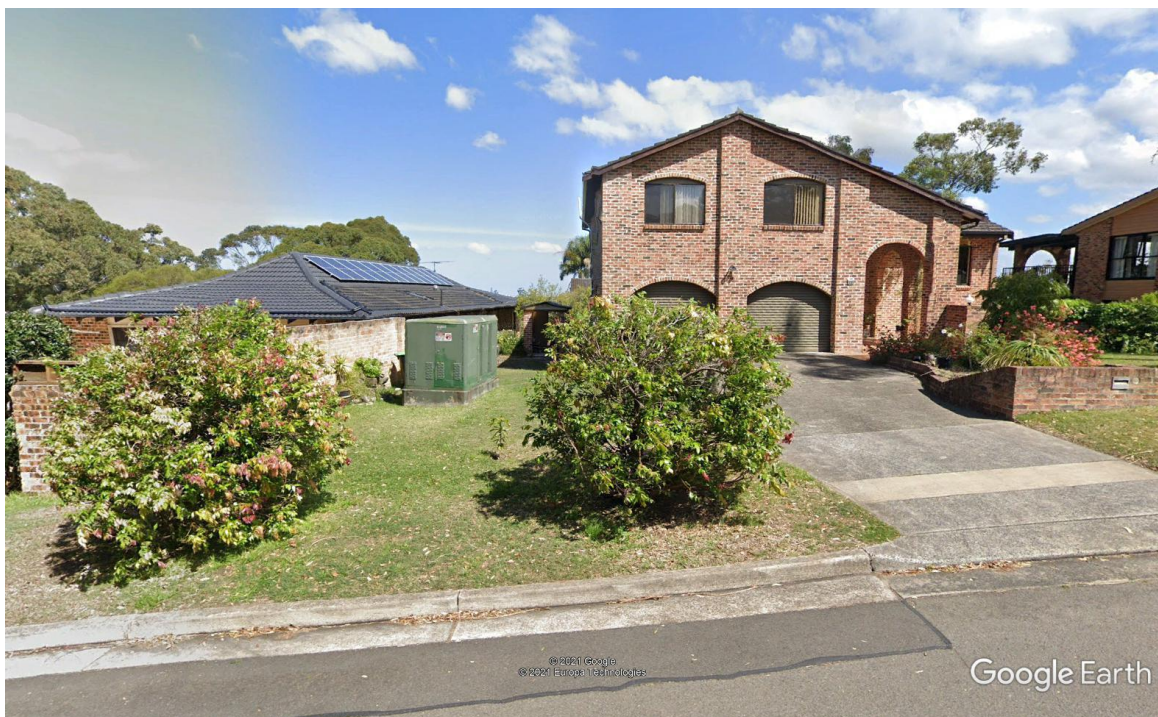
View of the northern adjoining property