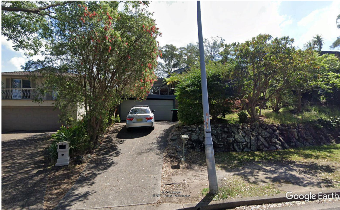
View of the southern adjoining property

The adjoining dwelling maintains a standard setback from the common boundary and has its outlook oriented to the front and back. The proposed upper level addition on the subject site is well distant from this adjoining dwelling and will have no impacts in terms of privacy loss or overshadowing.