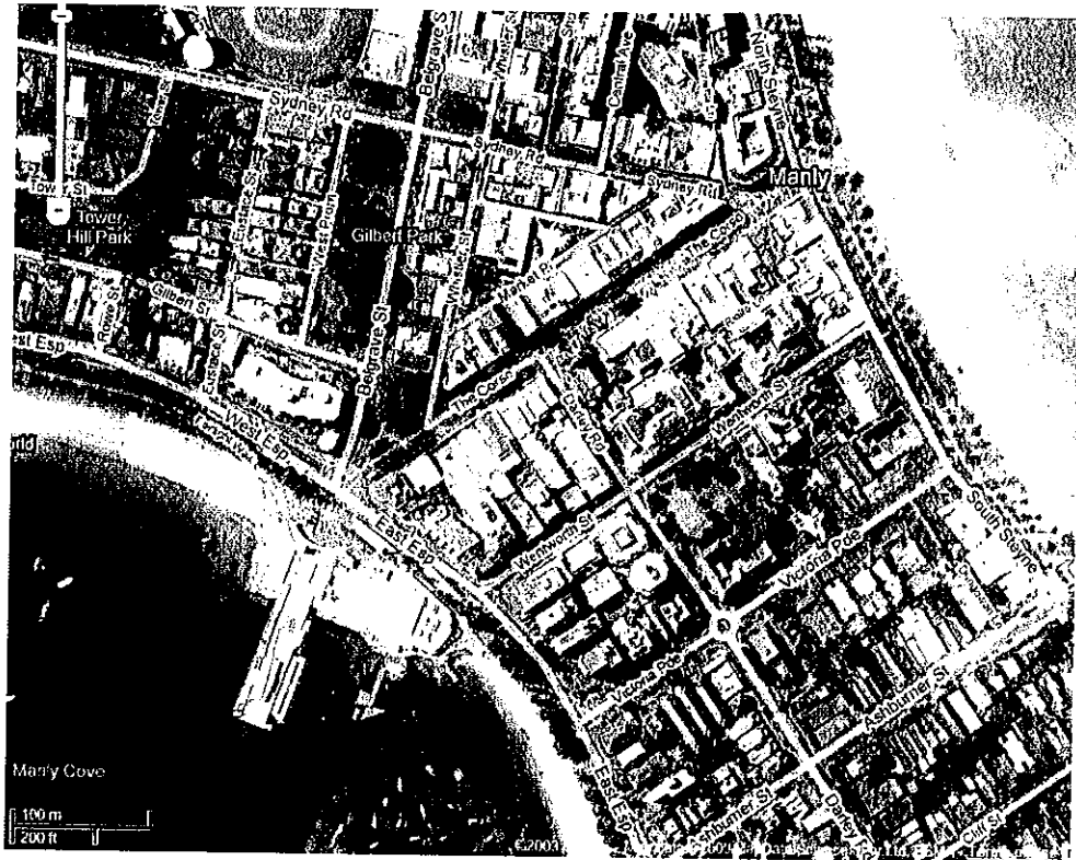
FOR INFORMATION ONLY - IMAGE FROM GOOGLE MAPS.