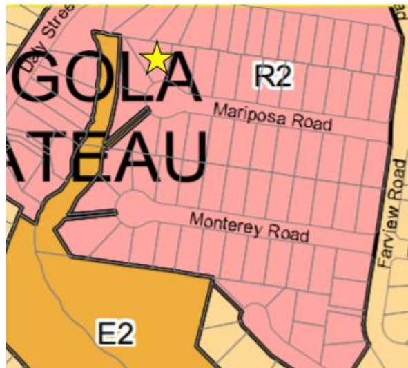
Fig 9: Extract of Pittwater Local Environmental Plan 2014 Zoning Map

The subject site is zoned R2 Low Density Residential under the Pittwater LEP 2014.