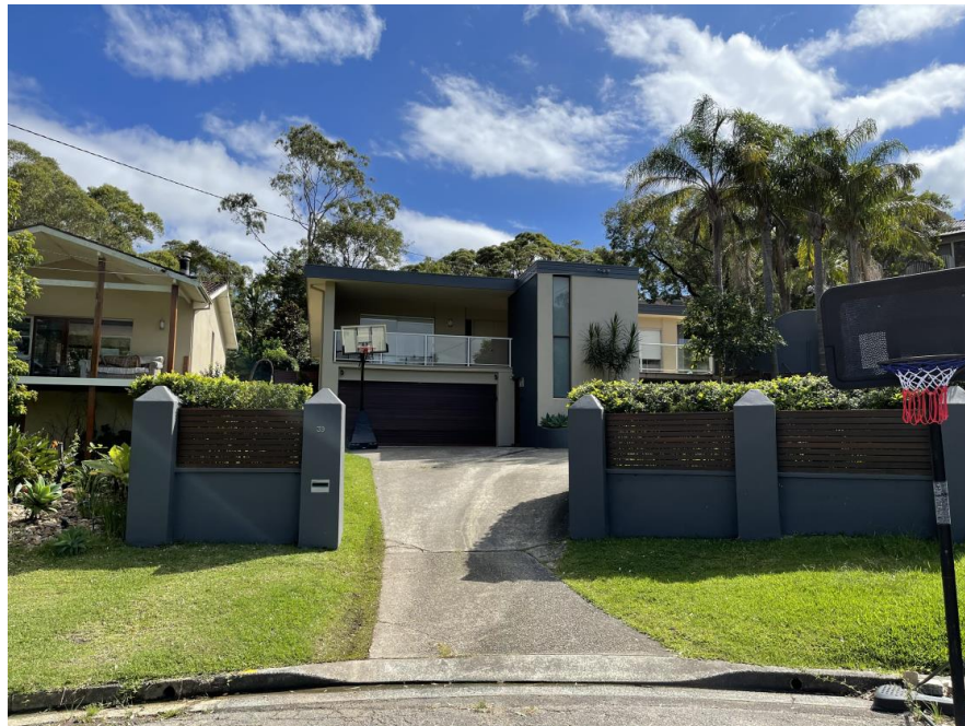
Fig 2: View of the subject site, looking north-west from Mariposa Road