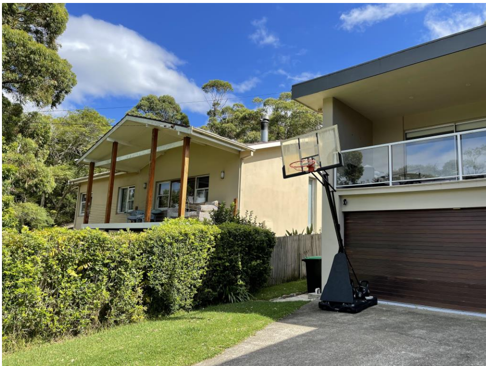
Fig 4: View looking west across the front yard, towards the adjoining dwelling at No 41 Mariposa Road