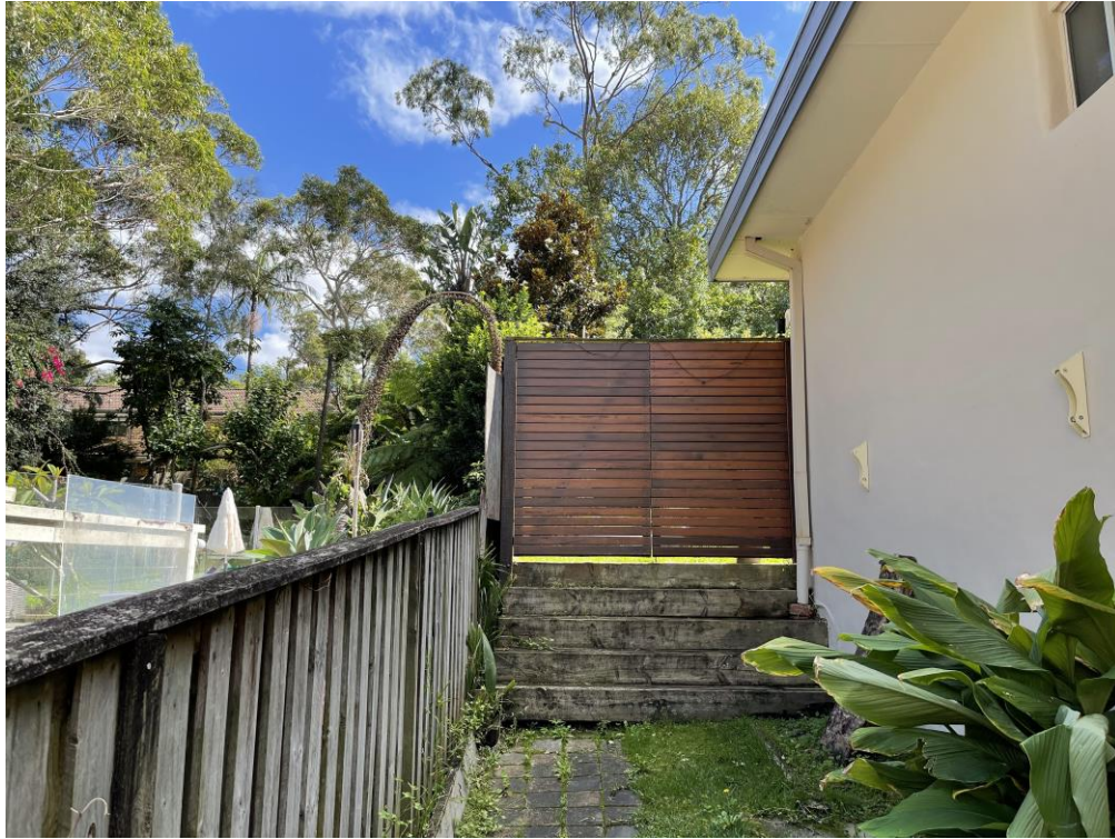
Fig 5: View looking north- west along the side boundary, looking towards the rear yard of the subject site