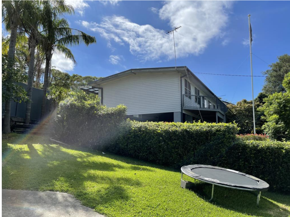
Fig 3: View looking north east across the front yard, towards the adjoining dwelling at No 37 Mariposa Road