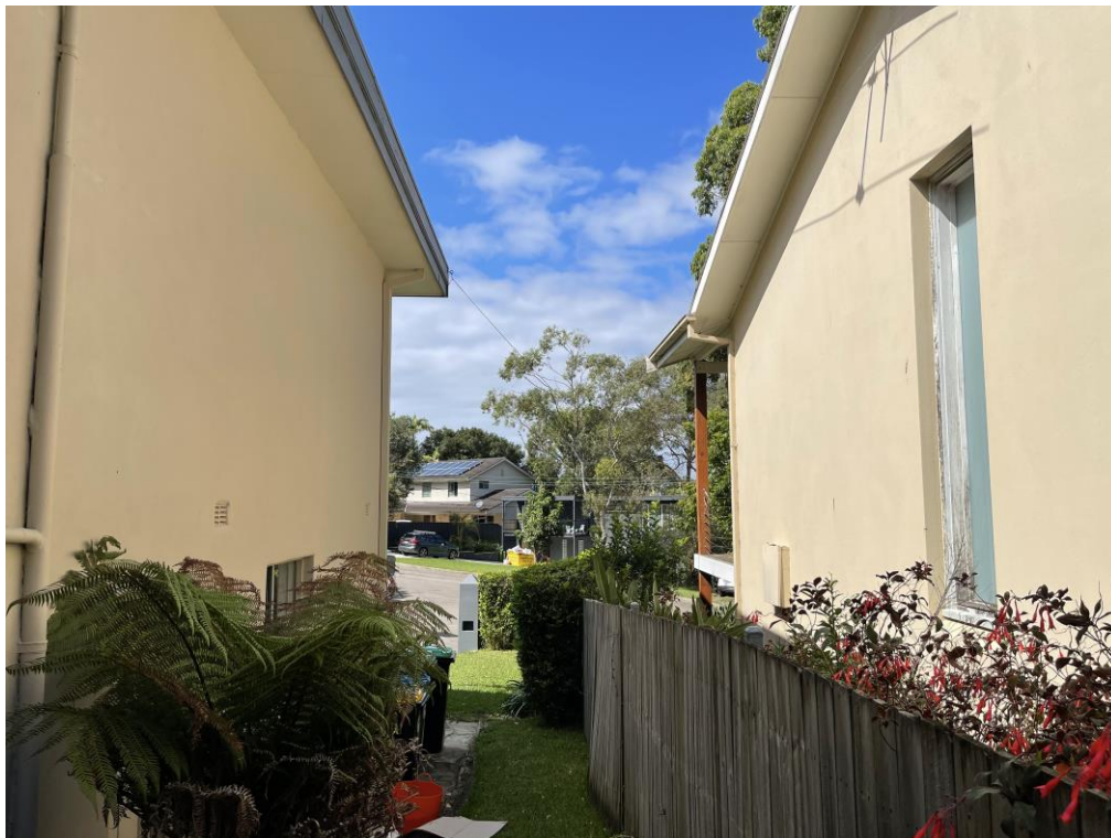
Fig 6: View looking south-east along the side boundary, looking towards the front boundary of the subject site