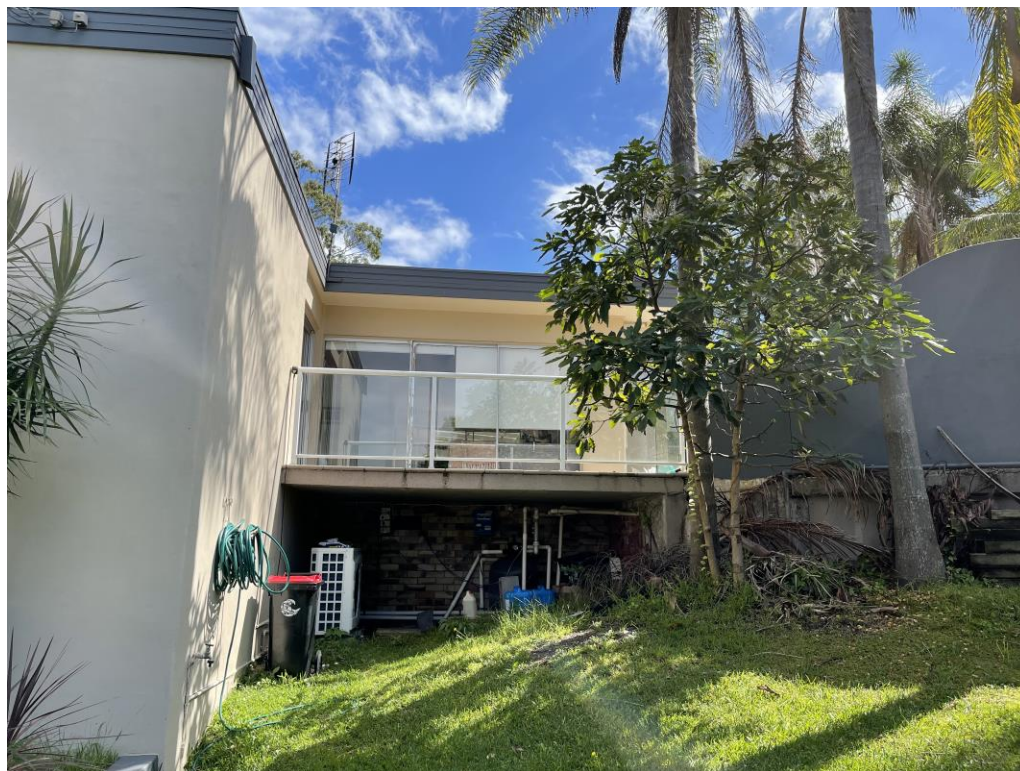
Fig 7: View looking towards the location of the proposed media room extension with externally accessed store under