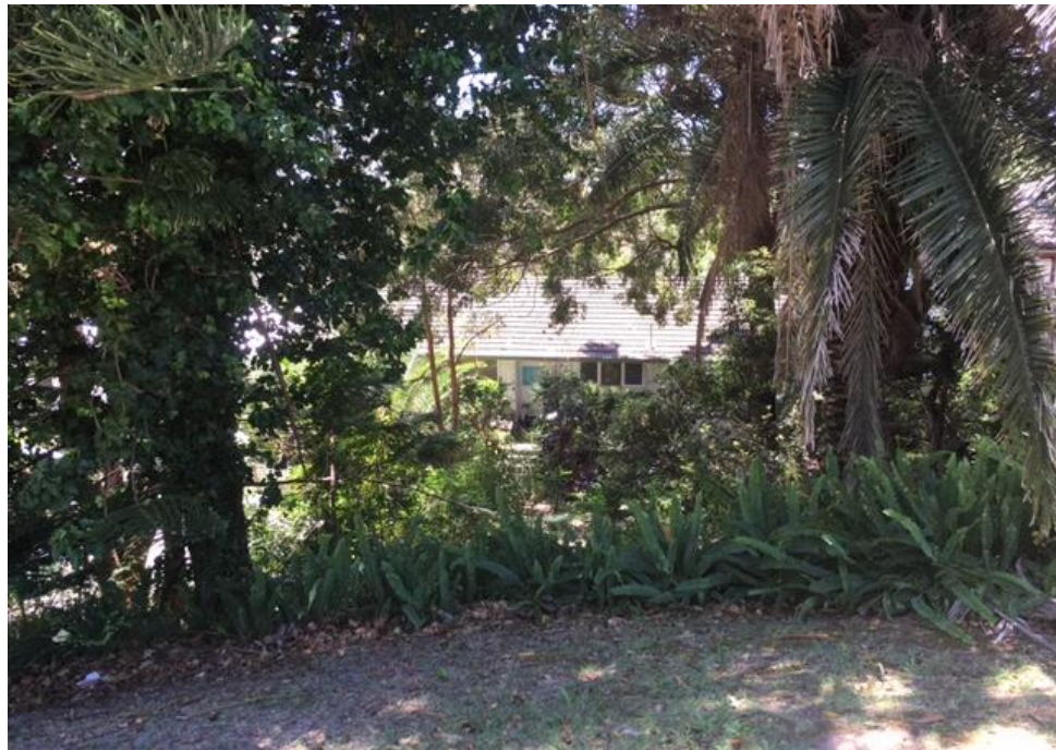
Fig 5: View of neighbouring property to west, No. 4 Old Barrenjoey Road