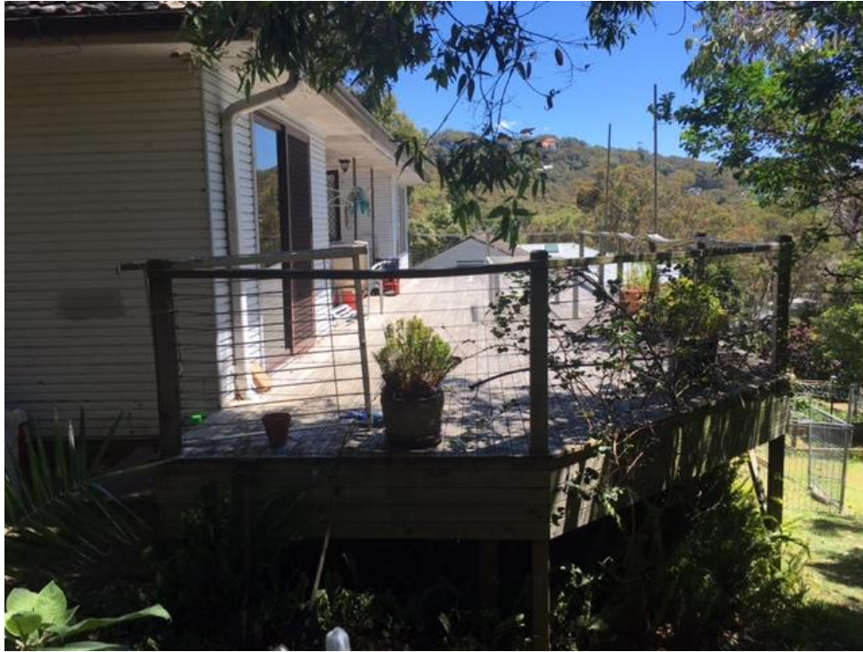
Fig 4: View of existing rear deck of subject dwelling, looking west