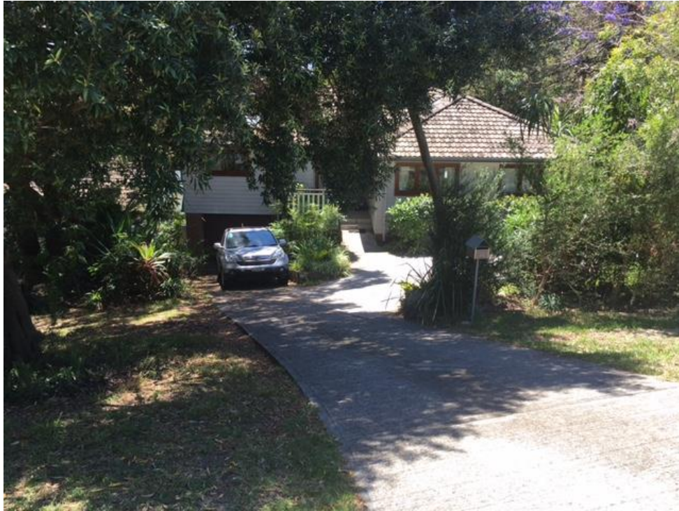
Fig 2: View of subject site from Old Barrenjoey Road, looking north-east