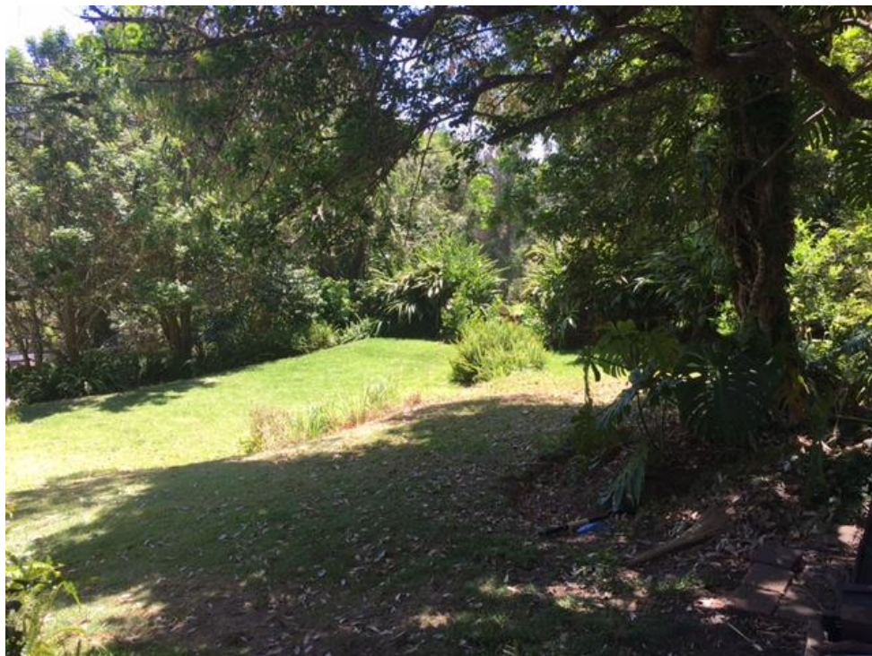
Fig 3: View of rear yard subject site, looking north-west