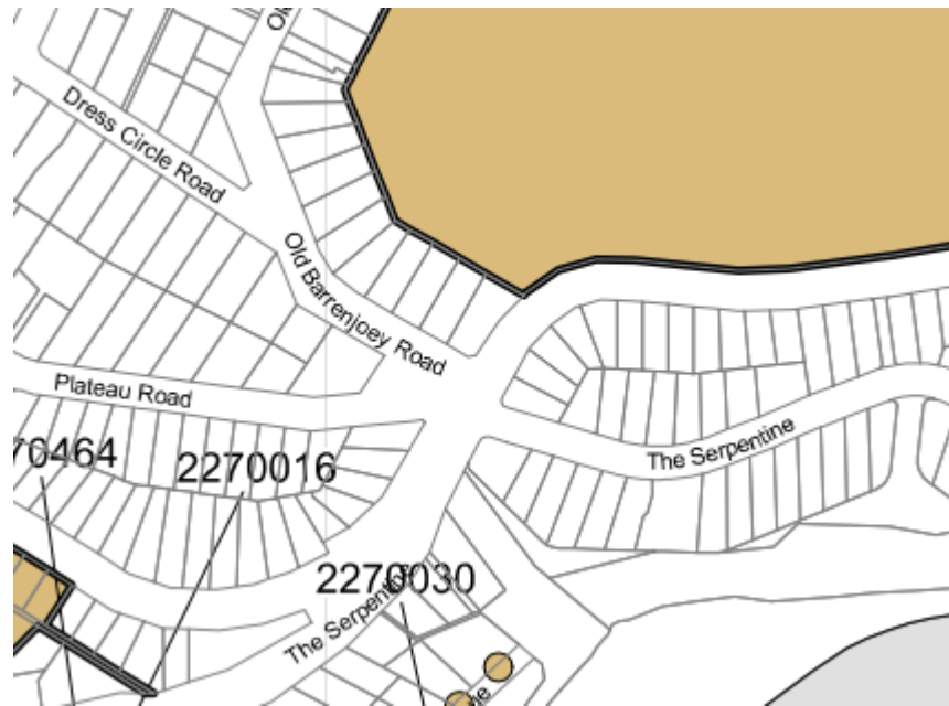
Fig 8: Extract from Pittwater LEP Heritage Map

The objectives of this clause read as follows: