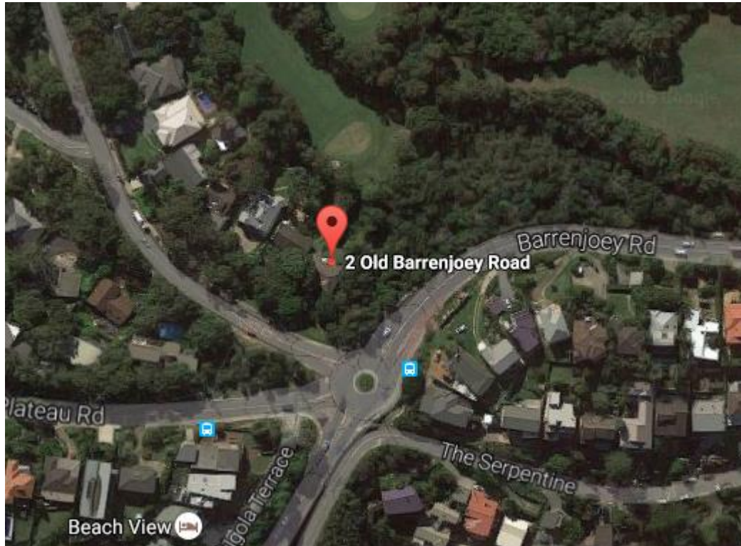
Fig 6: Aerial view of locality

The site enjoys a general local outlook towards Avalon Golf Course.