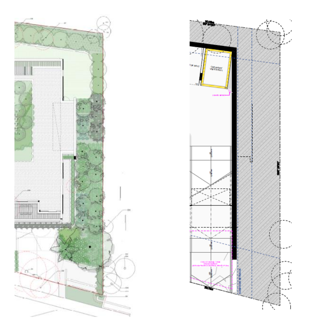
Figure 2 – Basement and landscape plan extracts showing deep soil landscape opportunity down the entire eastern setback area of the development.