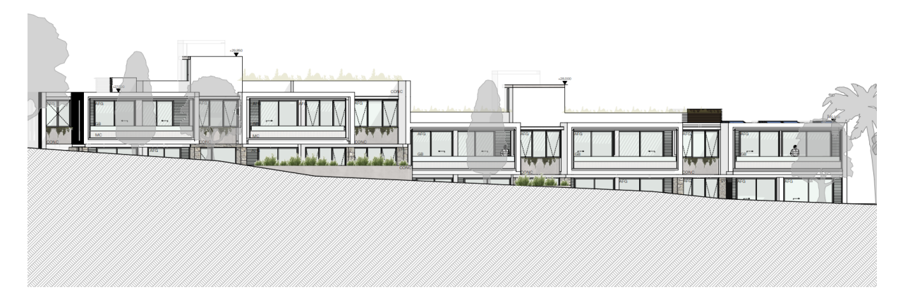
Figure 3 – Plan extract northern building facade

When the section plans are viewed concurrently with the northern elevation plan (Figure 3) it is evident that the building sits low down into the site as viewed from the northern adjoining properties with the visual privacy afforded by spatial separation (compliant with the DCP rear boundary setback control), boundary fence treatments and the 2 - 3 metre high Lilli Pilli screen proposed adjacent to the entire northern boundary collectively providing for an acceptable visual privacy outcome.