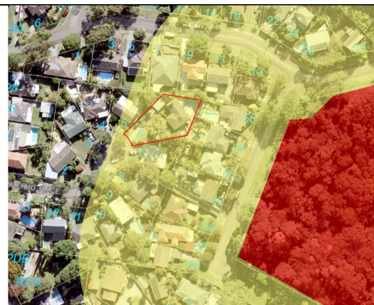
Northern Beaches Bush Fire Prone Land Map, Certified 7 August 2020

The adjacent image is the bushfire prone land map for the area.