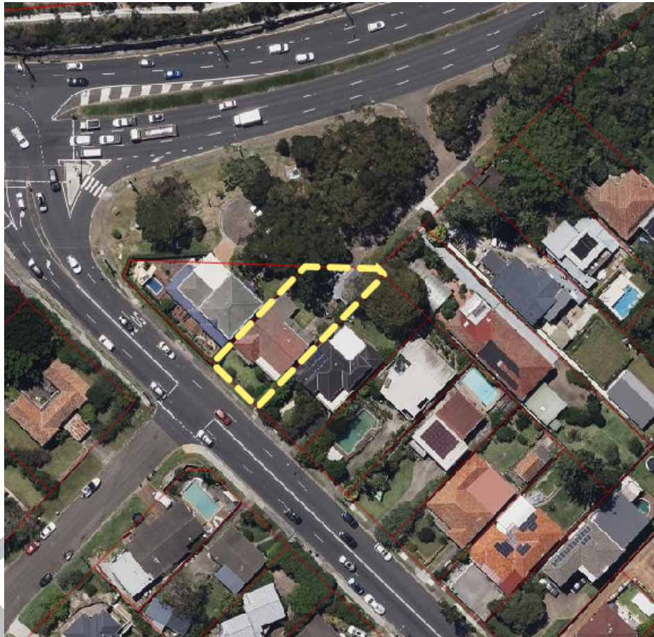
Aerial Photograph of Locality

The subject site and existing surrounding development are depicted in the following aerial photograph: