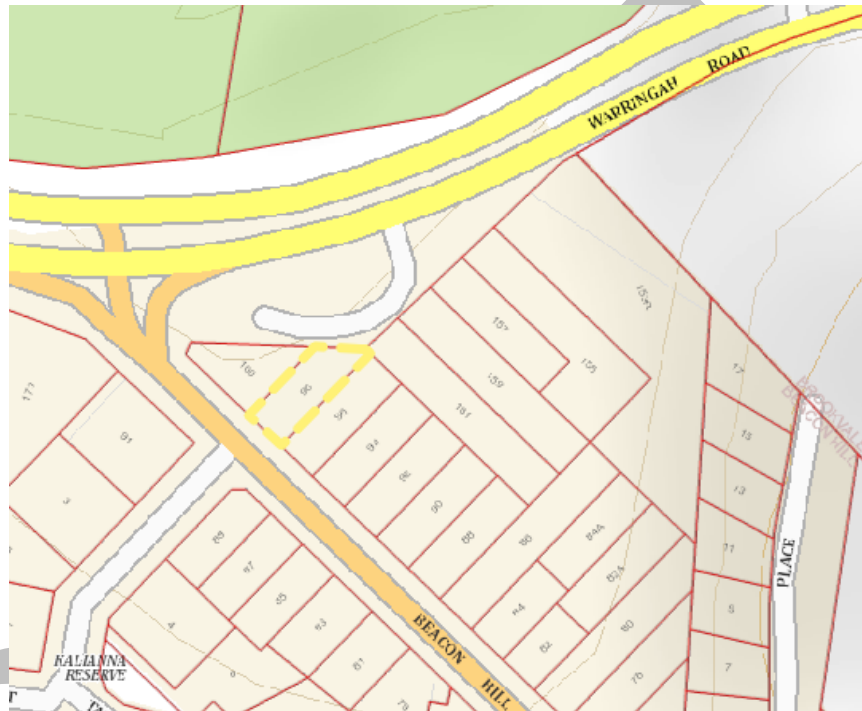
Site Location Map

The subject site is identified as Lot 7 in DP 25604 which is known as 98 Beacon Hill Road, Beacon Hill. The site is generally a rectangular shaped allotment with a splayed rear northern boundary. The site is located on the northern side of Beacon Hill Road and has an area of 599.7m 2 . The sites southern boundary have a frontage of 15.24m to Beacon Hill Road, with the northern boundary having a frontage of 17.72m to Warringah Road (service lane). The locality is depicted in the following map: