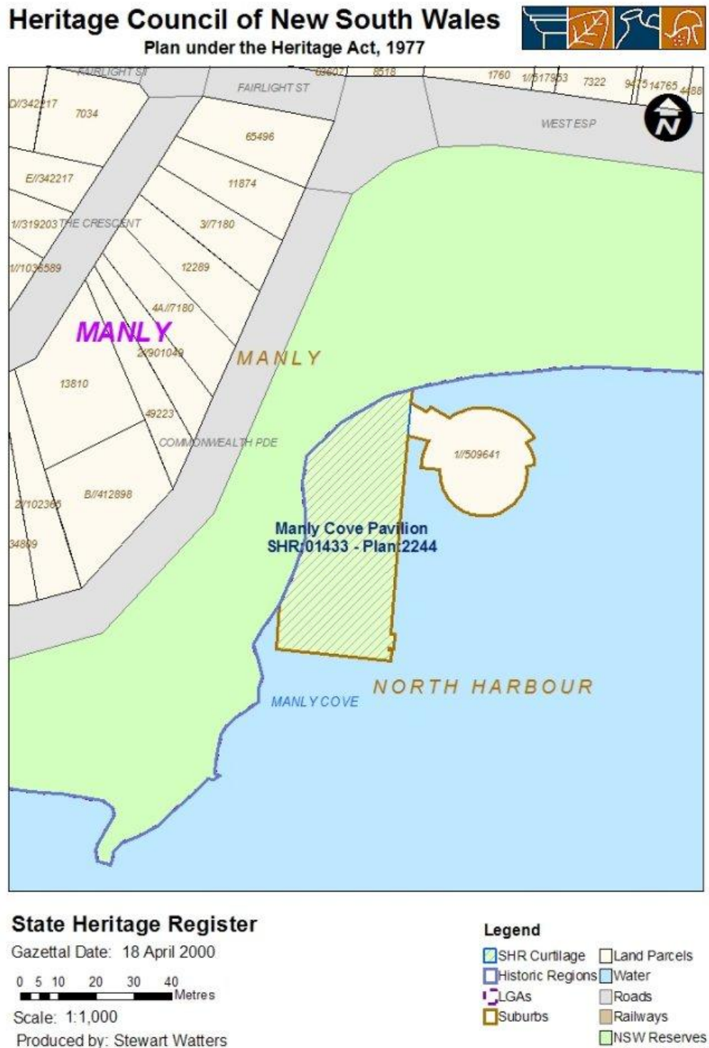
Figure A – State Heritage Register Plan – Manly Cove Pavilion – Ref NSW State Heritage Register