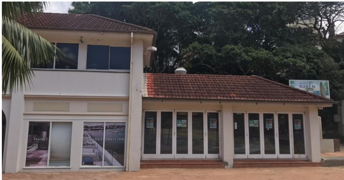
Figure G – Manly Cove Pavilion and Manly Sliderz Cafe– Photo by Rich Carr Architects