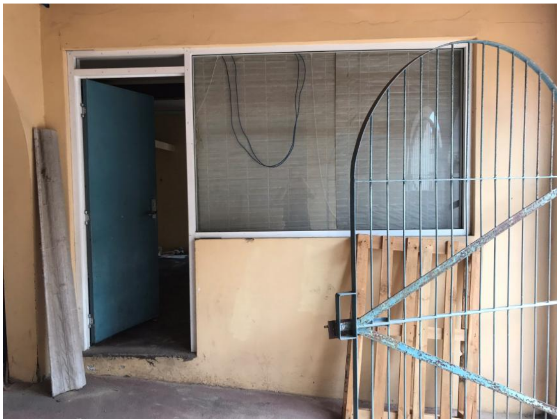
Figure D – Manly Cove Pavilion breezeway aluminum window– Photo by Rich Carr Architects