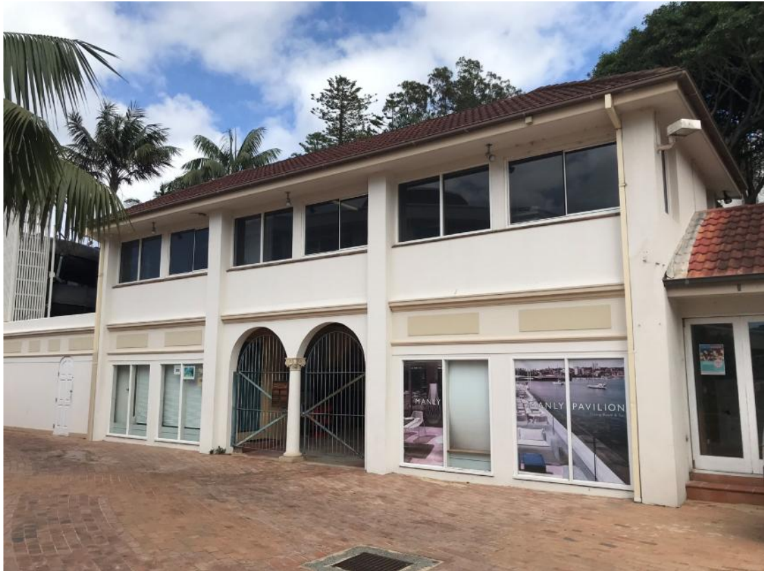
Figure E – Manly Cove Pavilion– Photo by Rich Carr Architects