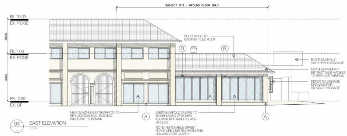
Figure H – Manly Pavilion proposed east elevation– Prepared by Rich Carr Architects