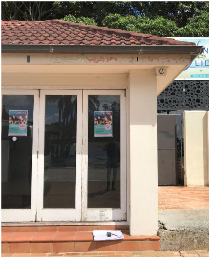
Figure F – Existing timber bifold doors