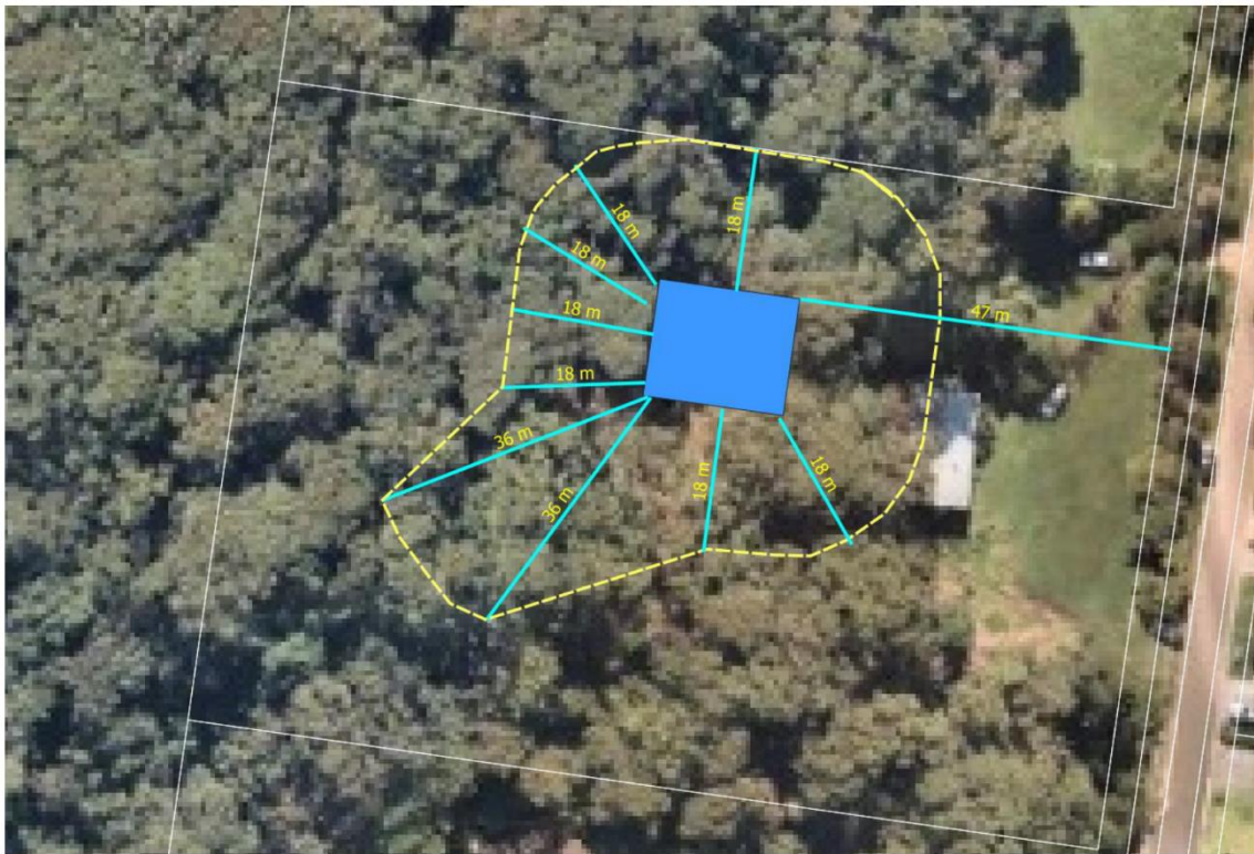
Map 3 shows the estimated APZ to achieve BAL-40. The total area of the APZ as shown is 2934m 2 . Some of the above area of the required APZ is already managed land.

APZ Notes as per Bushfire Risk Assessment: In my opinion this provision is being followed as per the PBP and NSW RFS 'Standards for asset protection zones' based on the bushfire risk assessment guidelines as per the Planning for Bushfire Protection 2019 (PBP 2019).