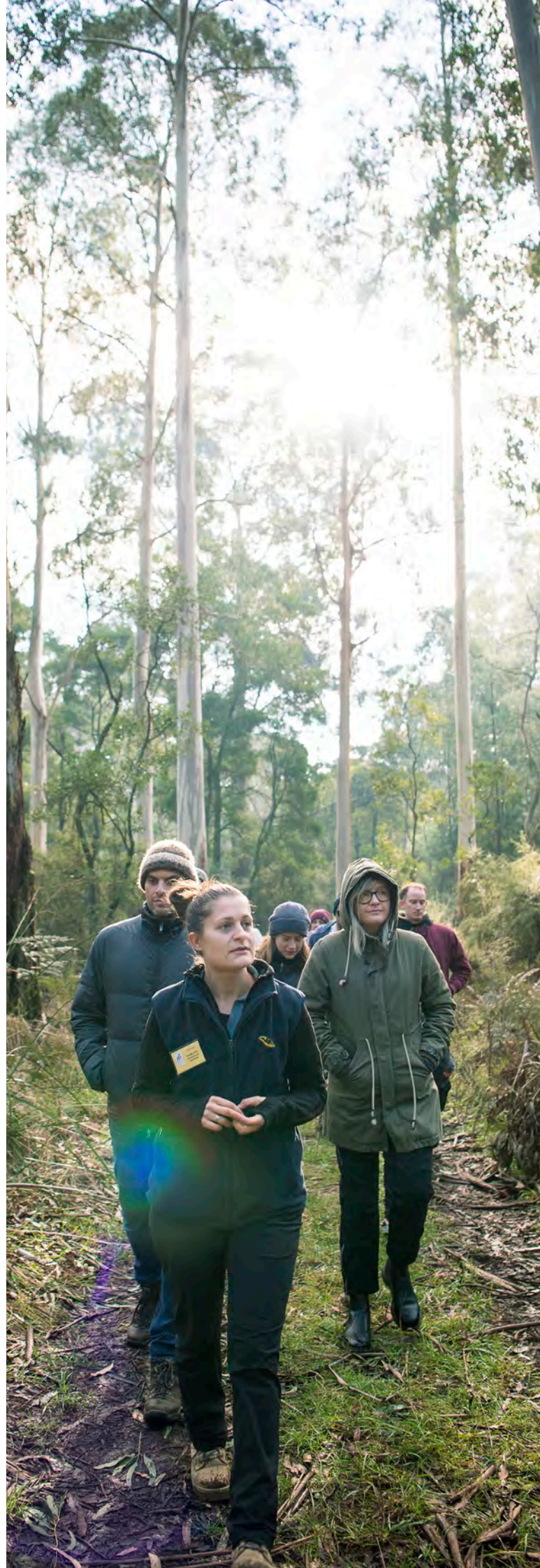
Right. Bushwalkers, Victoria.

This connection with local bushland often extends to a sense of care and protection, especially when favourite places are threatened by yet more urban sprawl, pollution and industrialisation. That's why local people across the country are organising their communities to protect and restore urban habitat, and the threatened species which survive there.