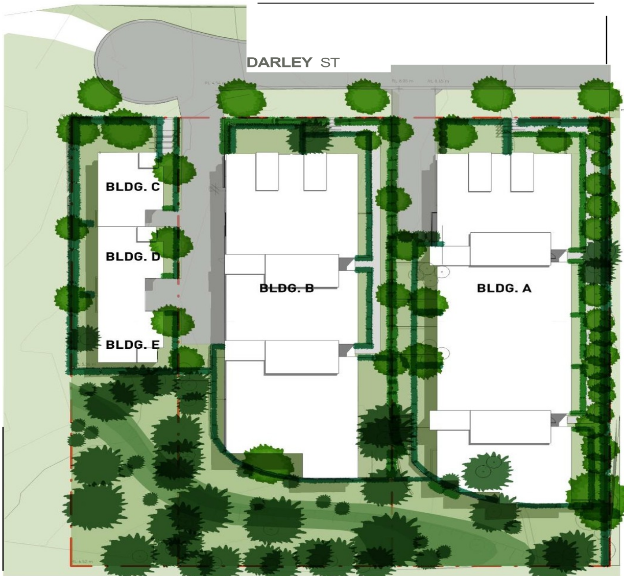
Figure 8 : Concept Plan (BLDA=20 units ; BLDB = 18 units ; BLD B,C & D = 3 townhouses )