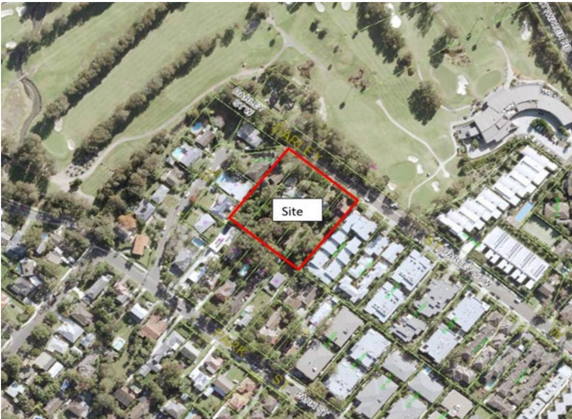
Figure 1 : Aerial photo of site and adjoining properties