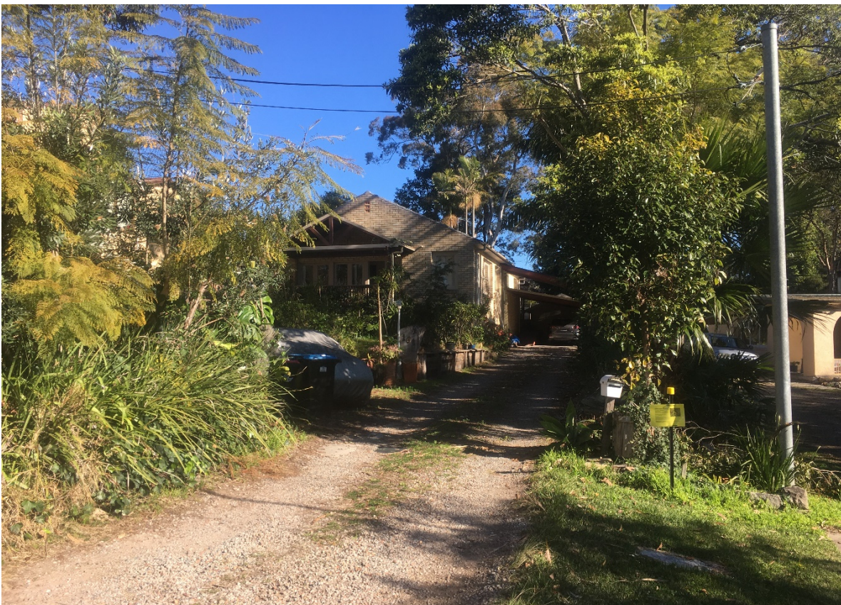
Figure 3 : 161 Darley Street West