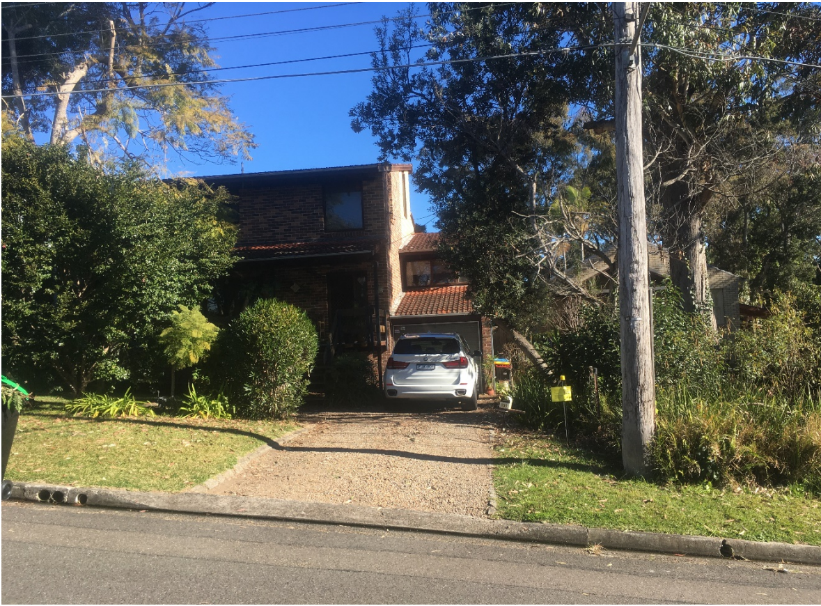
Figure 2 : 159 Darley Street West