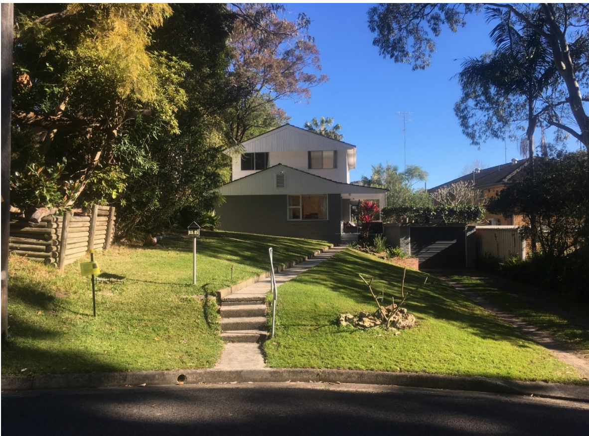
Figure 5 : 167 Darley Street West