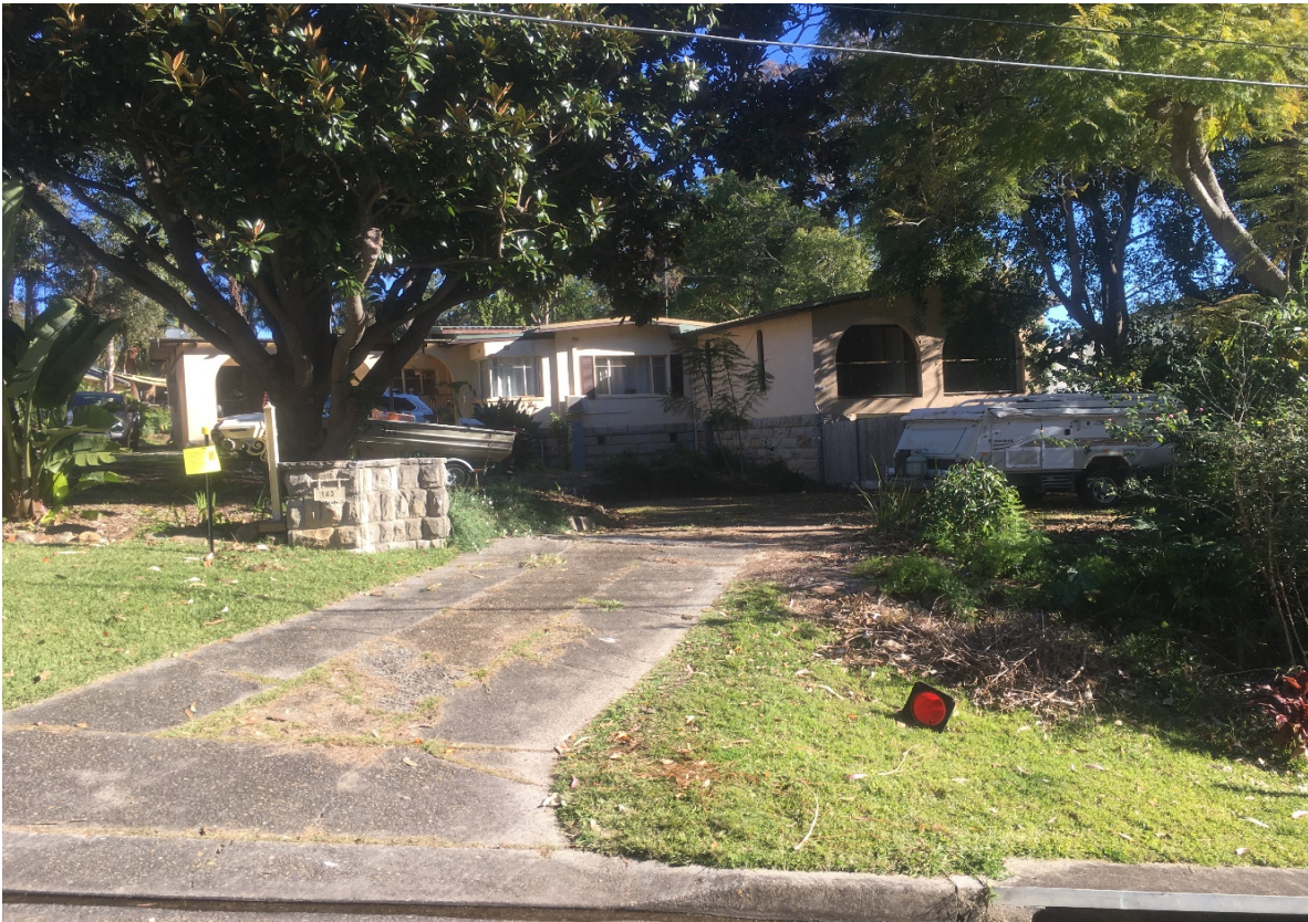
Figure 4 : 163 Darley Street West (double block)