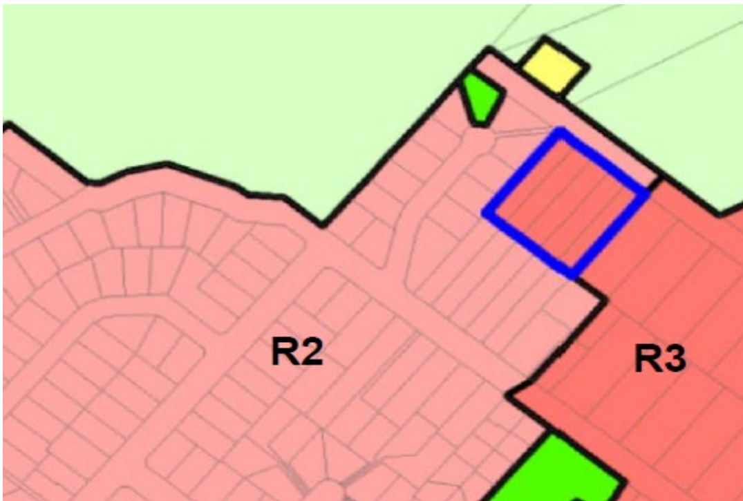
Figure 7 : Site - Proposed Zoning