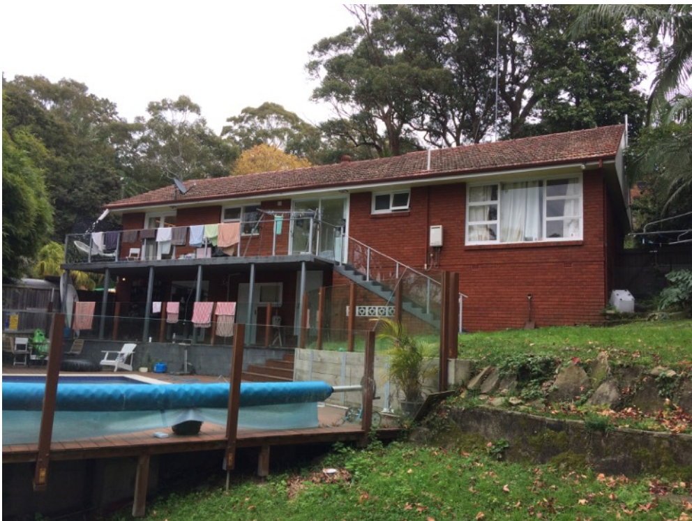
FIGURE 3: EXISTING RESIDENCE - VIEW FROM NORTH EAST