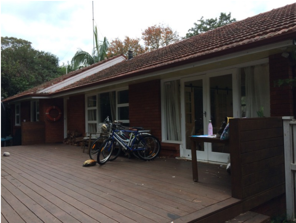
FIGURE 2: EXISTING RESIDENCE - VIEW FROM SOUTH WEST