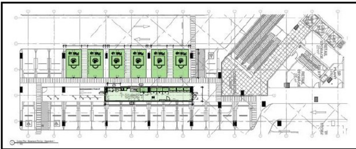
Figure 2: Layout of Click and Click service within Parking Level 1