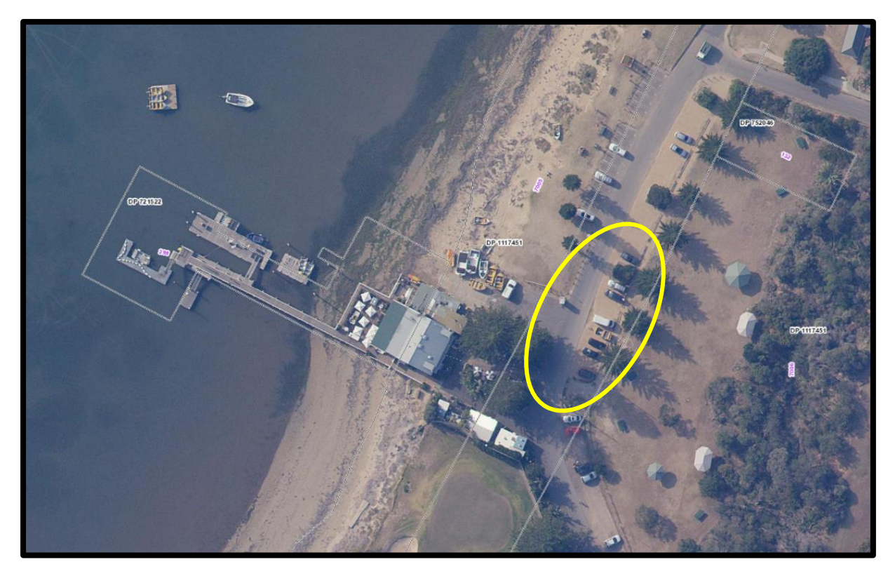
AERIAL PHOTOGRAPH OF SUBJECT SITE WITH CARPARK AREA CIRCLED