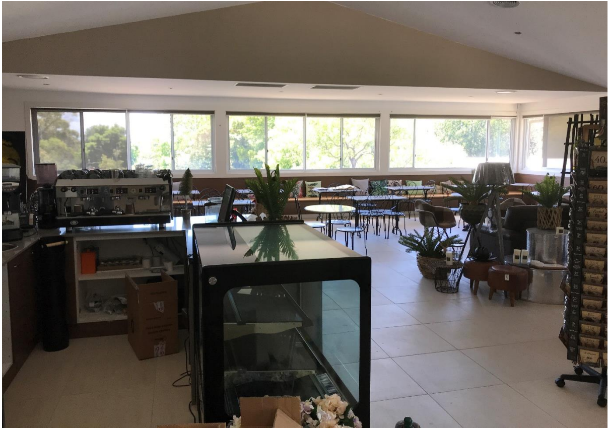
Figure 4 – Proposed café outlook