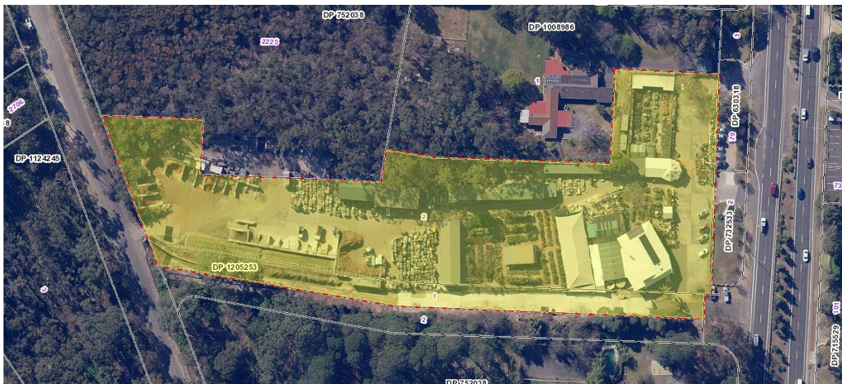
Figure 2 – Aerial map

200 Forest Way is irregular with a total area of 1.09 hectares with an 89.73 metre street frontage to Forest Way. The formerly Crown Road Reserve has a total area of 2,291m 2 with a width varies from 10.06m to 11.725m. Vehicular access is available from Forest Way.