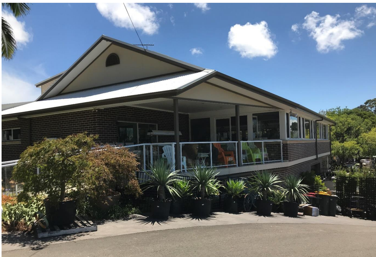
Figure 3 – Structure where the café will be contained

The site does not contain a heritage item nor is located within a Heritage Conservation Area. There are no heritage items within the vicinity of the site.