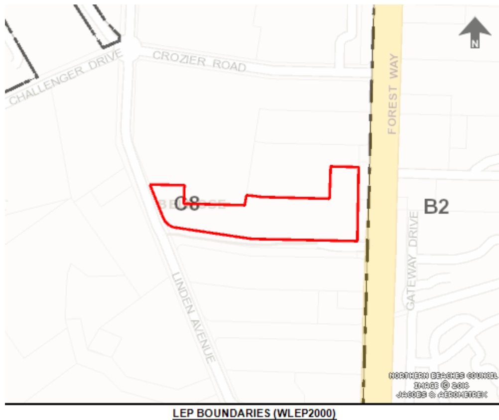
Figure 5 – LEP Locality Map (Warringah Council)

The site is located within Locality C8 Belrose North.