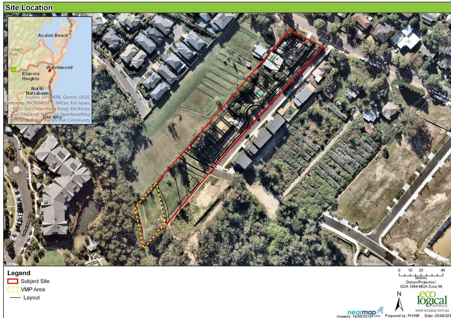
Figure 1: Site location