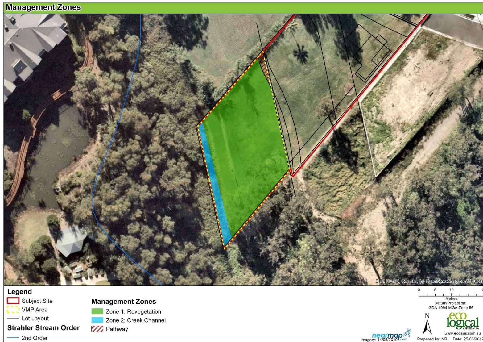
Figure 3: Vegetation management zones