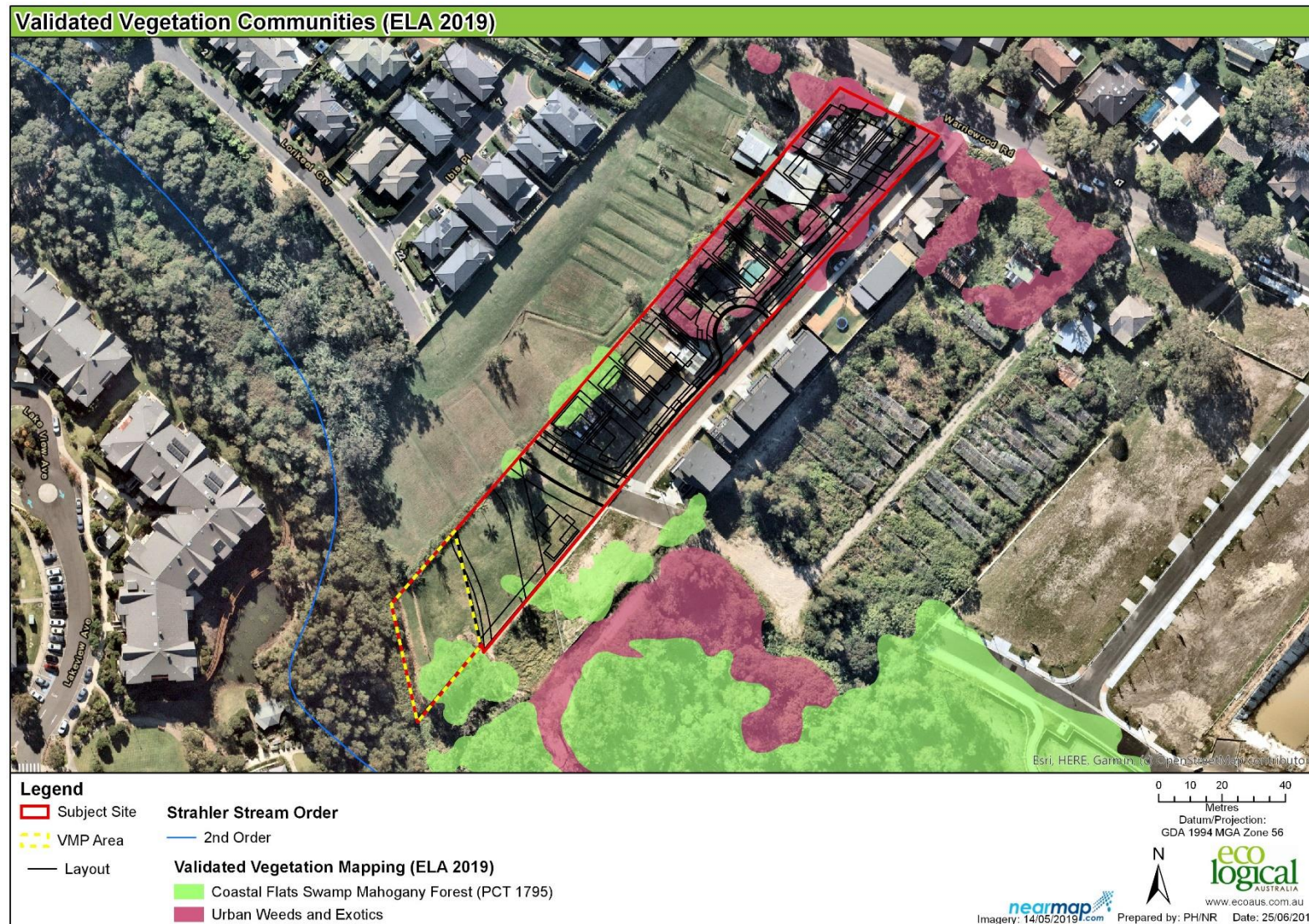
Figure 2: Vegetation communities within the subject site (ELA 2019)