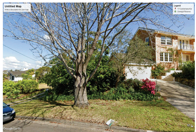
View towards adjoining property at 1 Donegal Road, with tree lined streetscape, landscaped gardens and Garage separating dwellings