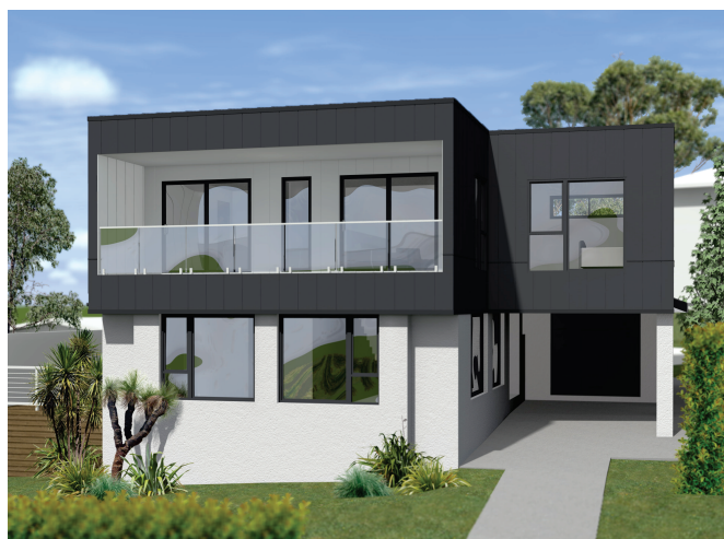
View of Proposed First Floor addition at 17 Connemara Avenue from in front of Dwelling, Streetscape and landscaped gardens to be maintained