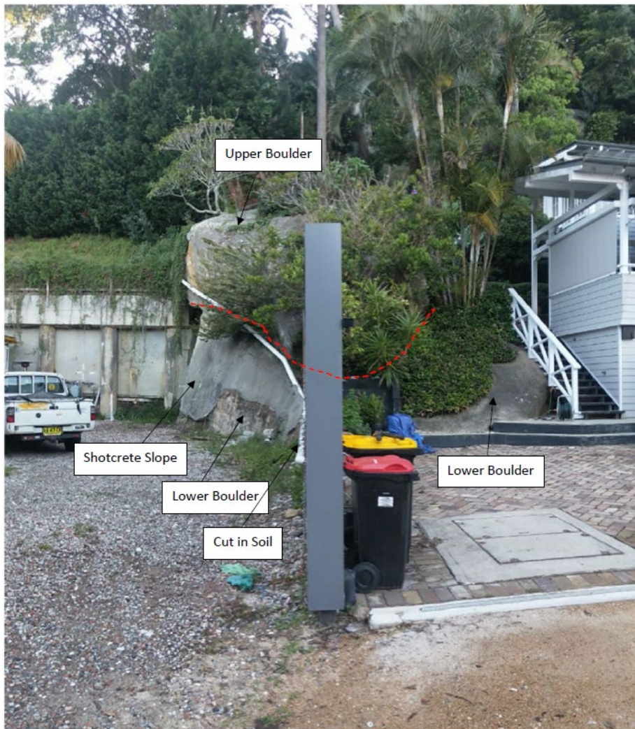
Photos extracted from report prepared by JK Geotechnics

The geotechnical report says that “portions of the existing boulders and shotcrete (and possibly mesh and bolts) at the southern end of the site will be removed during excavation of the proposed excavation footprint) (Section 7.1.3, page 19, JK Geotechnics report).