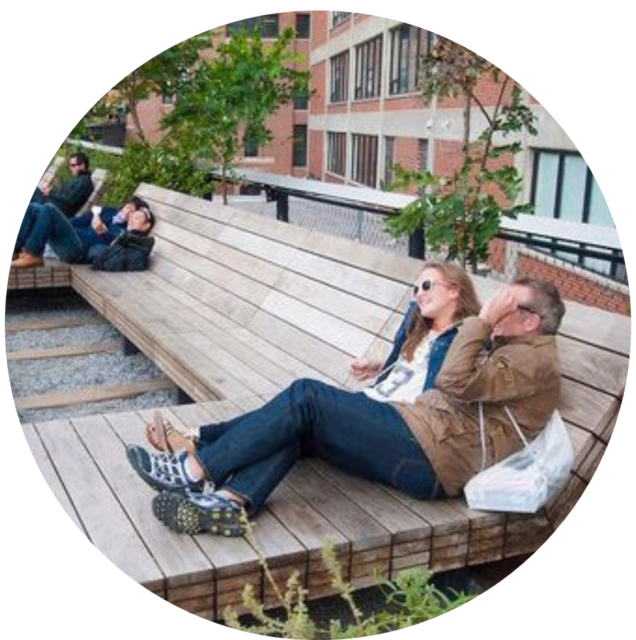
Proposed lounge seating areas