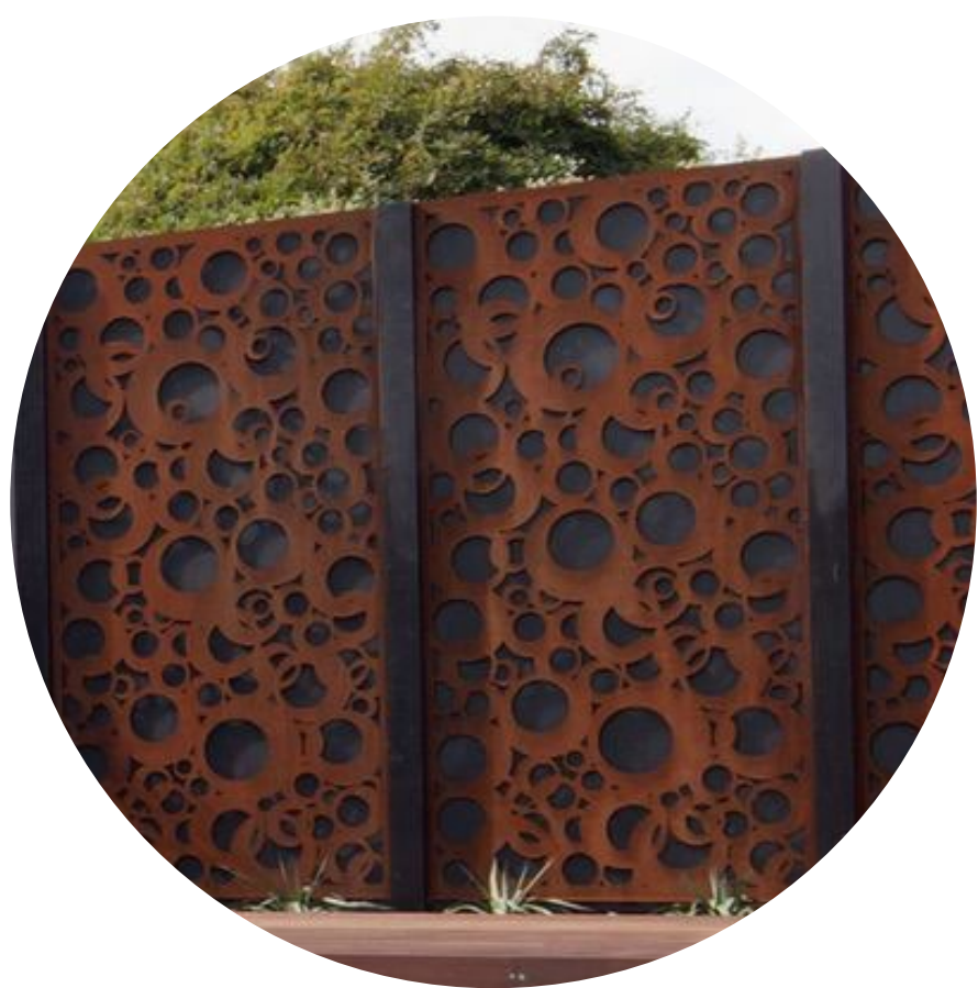
Decorative screening for potential privacy, wind and fall protection