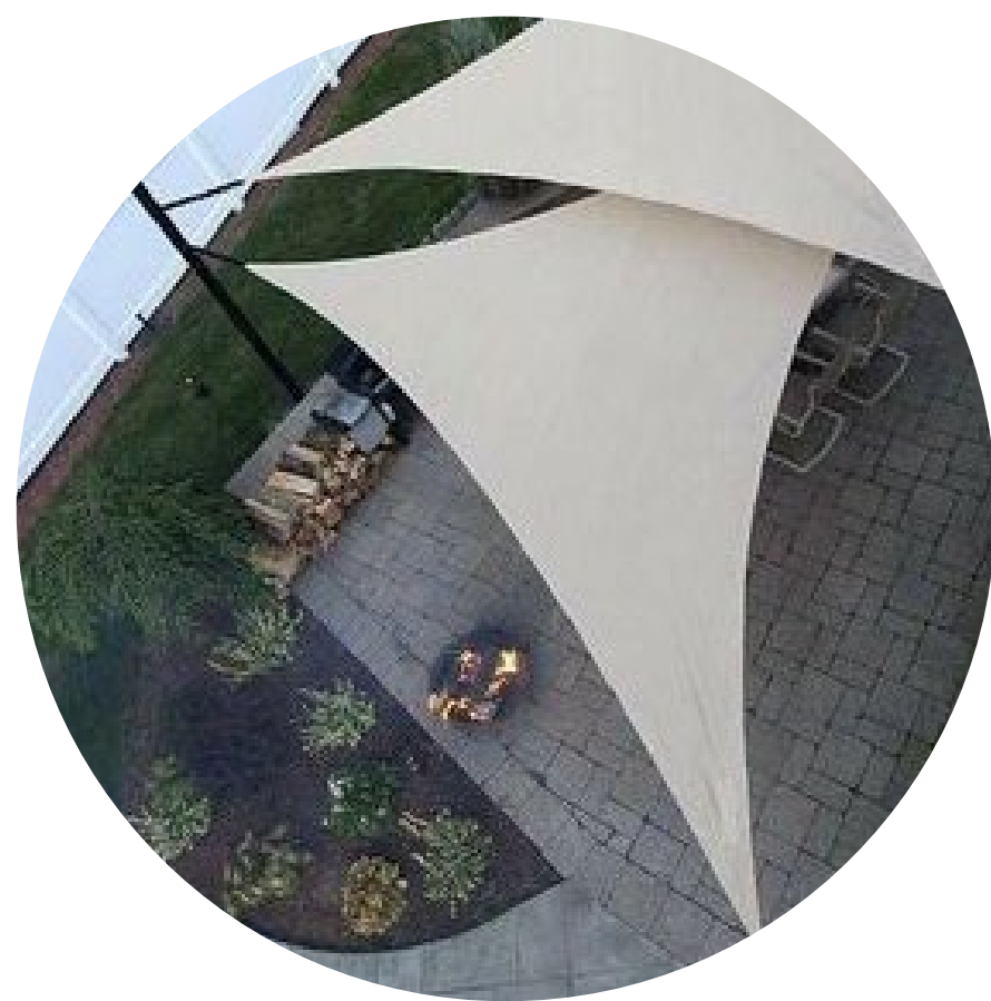
Shaded areas with shade sails