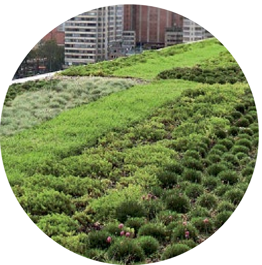
Green Roof planting matrix

© 2016 Site Image (NSW) Pty Ltd. ABN 44 801 262 380 as agent for Site Image NSW Partnership. All rights reserved. This drawing is copyright and shall not be reproduced or copied in any form or by any means (graphic, electronic or mechanical including photocopy) without the written permission of Site Image (NSW) Pty Ltd. Any license, expressed or implied, to use this document for any purpose what so ever is restricted to the terms of the written agreement between Site Image (NSW) Pty Ltd and the instructing party.