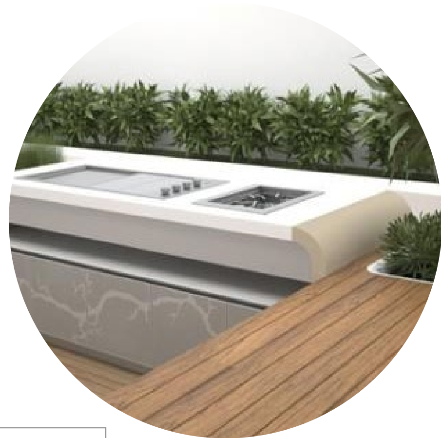
Communal BBQ area