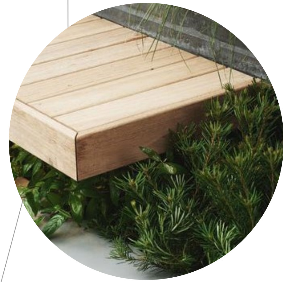
Proposed timber elements