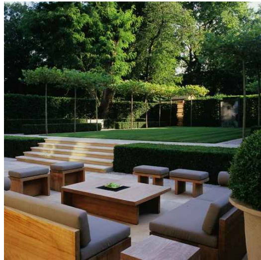
Grand stairs to lawn level