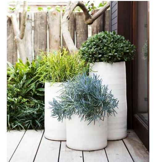
Assortment of pot plants

NOTES: - Contractors to check and verify all dimensions and all levels on site prior to any works. - Any discrepancies should be immediately referred to Space Landscape Designs. - All work to comply with B.C.A. Statutory Authorities and relevant Australian Standards. - Dimensions recognised over scaling. All measurements are in millimetres.