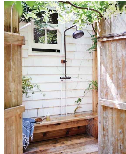
Enclosed shower with bench seat

All levels and heights need to be checked on site before construction. Note this plan was not created off a survey so measurements and heights may differ from the plan.