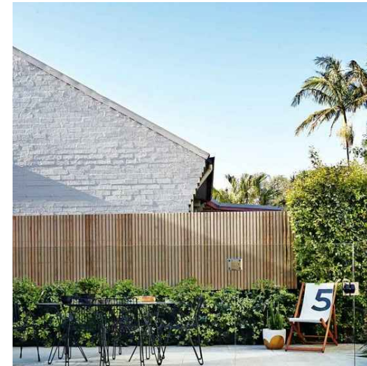
Example of feature screen