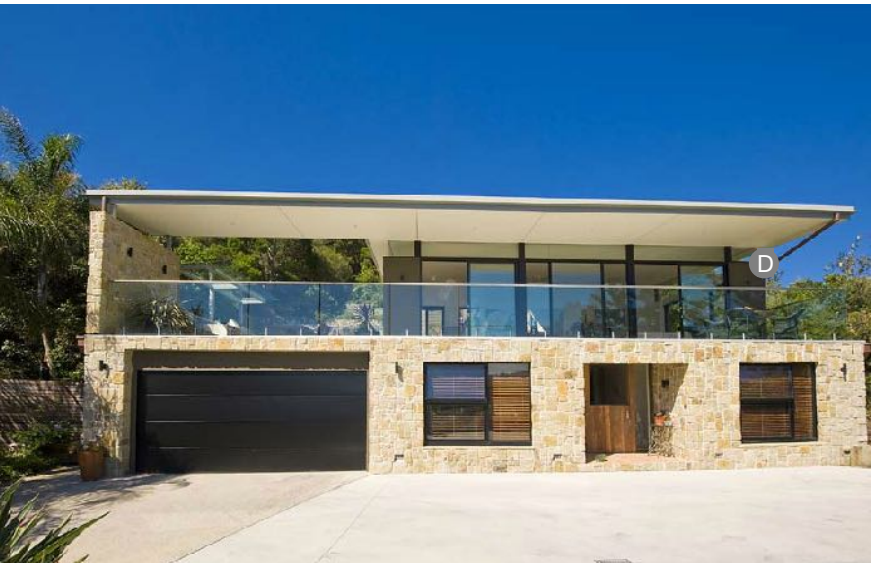
EXISTING FRONT FACADE