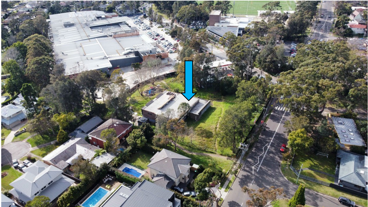
Figure 2: The site looking to the north-east (Prior to demolition)