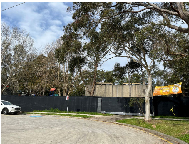
Figure 9: The site from Glenrose Place (Prior to demolition)