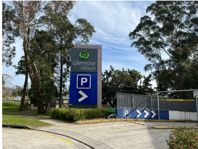
Figure 10: Car park entrance to Glenrose Village