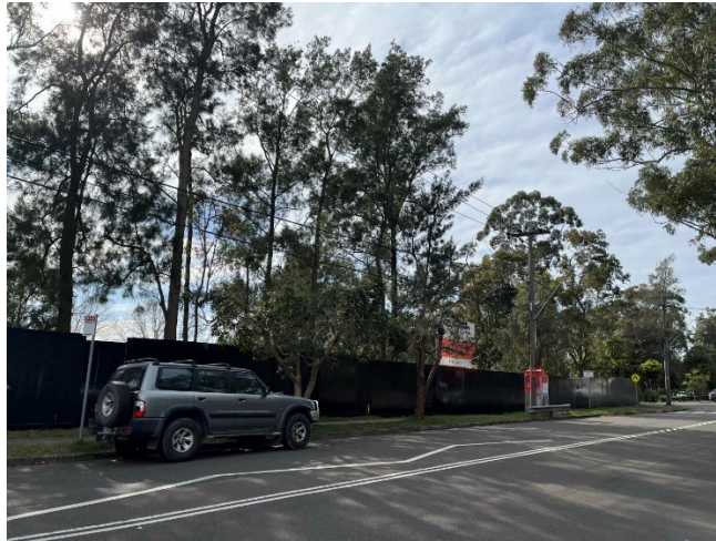
Figure 4: View of the site from Lockwood Avenue (Prior to demolition)