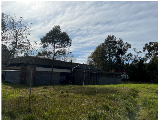
Figure 5: Building from Lockwood Avenue side (Prior to demolition)