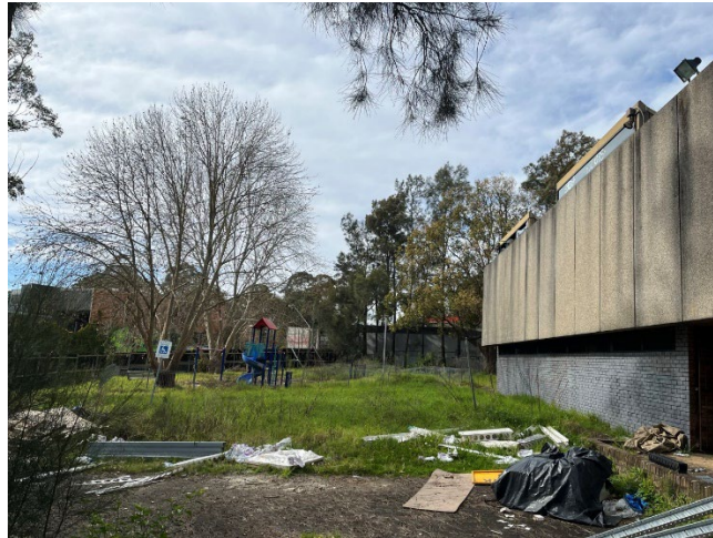
Figure 7: View of the site from the walkway (Prior to demolition)