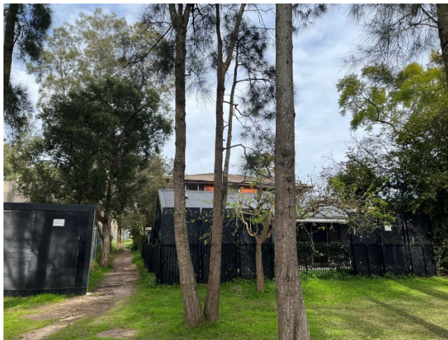
Figure 8: Child care centre and walkway to the west