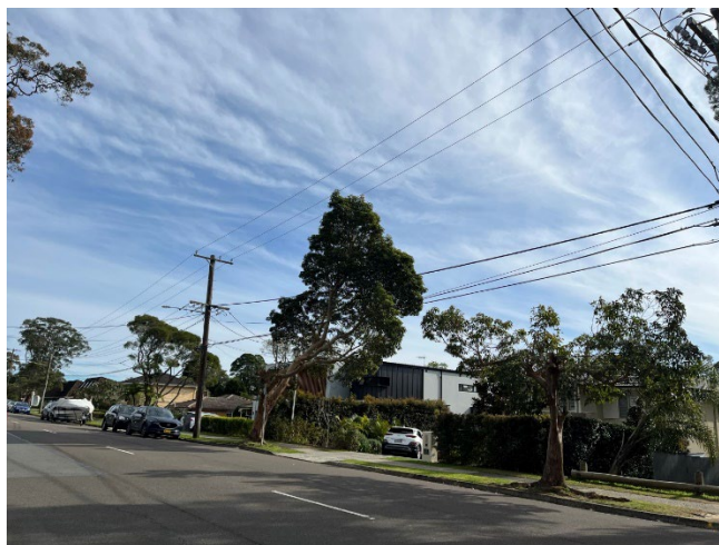
Figure 6: Dwellings to the west on Lockwood Avenue