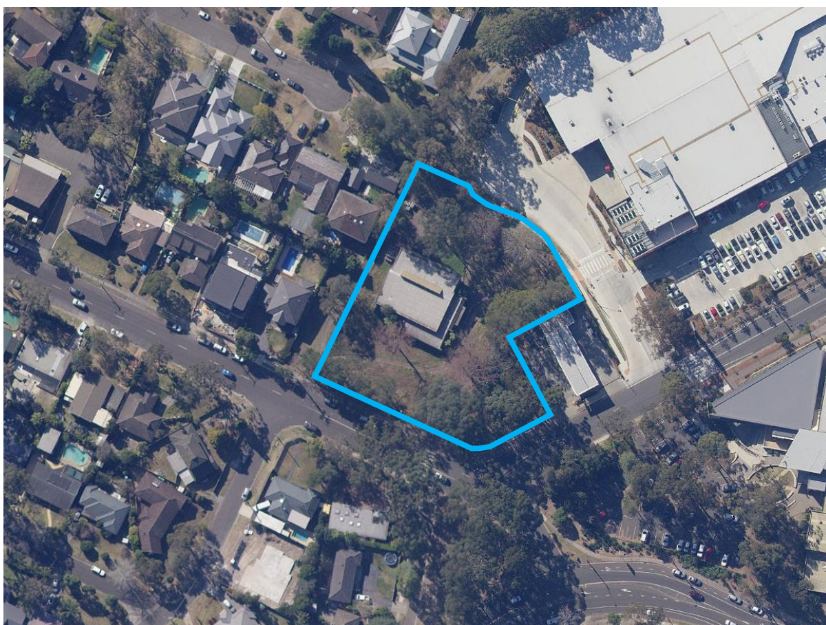
Figure 1: The site and surrounding area (Prior to demolition)

Adjoining the site to the south-east is a petrol station, across the road to the south are residential dwellings, to the west are also dwellings with a pedestrian walkway in between, to the north are also dwellings and towards the east is the Glenrose Village shopping centre.