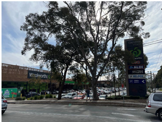
Figure 11: Glenrose Village further east from the site