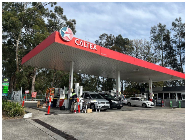
Figure 12: Petrol station adjoining the site to the east