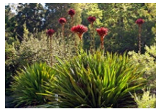
DE GYMEA LILLY Doryanthes excelsa

A perennial, rhizomatous herb found throughout eastern Australia. The leaves are 40 cm to 80 cm in long, and generally have a leaf of about 8 mm to 12 mm wide. It grows in a variety of soil types and is frost, heat and drought tolerant.