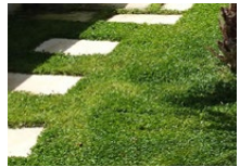
DR KIDNEY WEED Dichondra Repens

A hardy Australian native ground cover, bright pink daisy flowers throughout most of the year with the main flush in spring and summer. Is drought hardy and suitable for sandy soils. Prefers a full sun position and is suitable for pots. Grows to 30cm high x 2m wide.