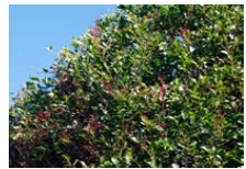
AS MIN 25L POT SMALL-LEAF LILLY PILLY Acmena smithii 'Hot Flush'

Fast growing Lilly Pilly that will grow to 10 metres, but can prune to desired height. Will grow up to 2 metres annually in perfect conditions. Will tolerate shade, full sun, part shade. This variety of Lilly Pilly is not susceptible to psyllids.