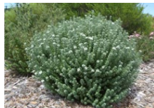
WF COASTAL ROSEMARY Westringia fruticosa

Philodendron xanadu is a plant that belongs to the family Araceae and subgenus Meconostigma, one of three subgenera within the genus Philodendron. This plant is native to Brazil, but is widely cultivated as a landscape plant in tropical, subtropical and warm temperate climates. Philodendron xanadu eventually forms dense clumps up to 1.5 metres tall by 2 metres wide.