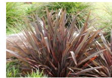
PT NEW ZEALAND FLAX Phormium Bronze Warrior

A shrub that grows near the coast in eastern Australia. The flowers are white, hairy and have the upper petal divided into two lobes. They also have orange-to-purplish spots on their bottom half. This shrub is very tough and grows on cliffs right next to the ocean. It reaches at least 2 m high and 5 m across