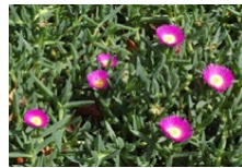
CR NATIVE PIGFACE Carpobrotus rossii

A flowering plant indigenous to the coastal areas of New South Wales near Sydney. The plant has sword-like leaves more than a meter long. It flowers in spring and summer, sending up a flower spike up to 6 m high, which at its apex bears a large cluster of bright red flowers, each 10 cm across.