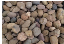
P1 WASHED RIVER PEBBLES

Nara has excellent salt tolerance, so in this respect, it is an excellent choice for coastal regions where other grasses simply cannot cope with excessive amounts of salt in the environment.