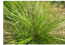
LL SPINY MAT RUSH Lomandra longifolia

The plant grows as a clump of long, straplike leaves, up to two metres long, from which arises a much taller flowering shoot, with dramatic yellow or red flowers