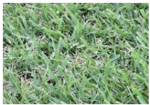
LAWN (L) NARA NATIVE TURF Nara Zoysia

- Ground Cover - Attractive between pavers and is useful for shaded areas steep banks and other inaccessible positions - Preferred aspect is full sun to 80% shade