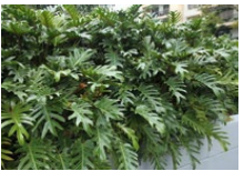
PX PHILODENDRON philodendron xanadu

A species of tree that grows along the east coast of Australia. One of the most widely distributed Banksia species, it occurs between Victoria and Central Queensland in a broad range of habitats, from coastal dunes to mountains. It is highly variable in form, but is most often encountered as a tree up to 25 metres (82 ft) in height.