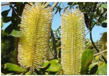
BI MIN 25L POT COASTAL BANKSIA Banksia integrifolia

Fast growing Lilly Pilly that will grow to 10 metres, but can prune to desired height. Will grow up to 2 metres annually in perfect conditions. Will tolerate shade, full sun, part shade. This variety of Lilly Pilly is not susceptible to psyllids.