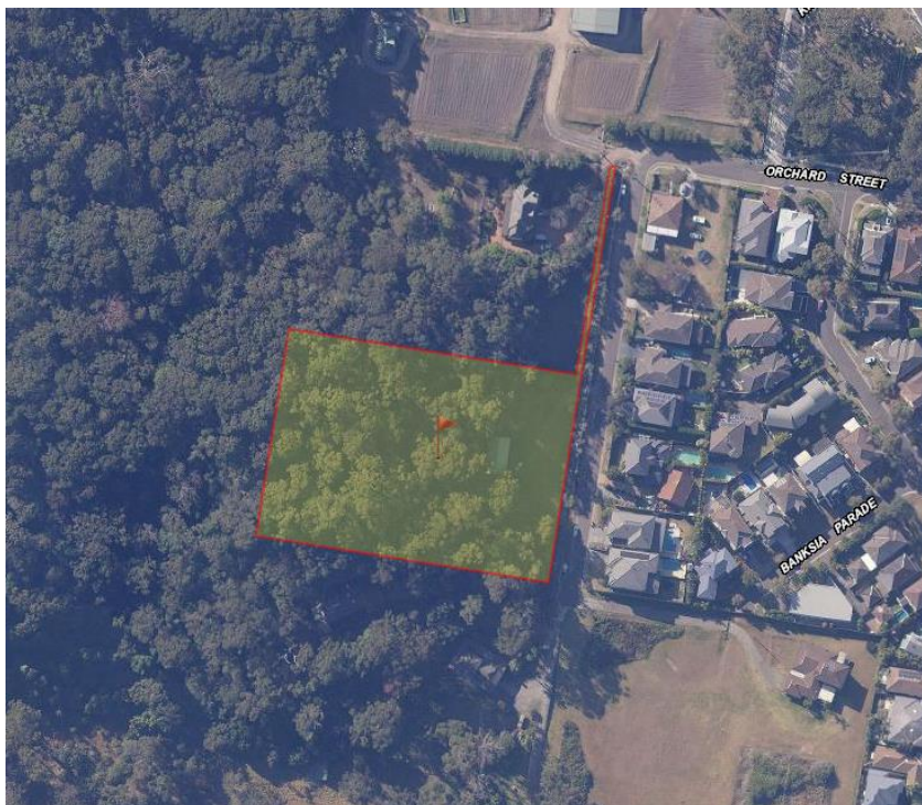
Figure 1: Aerial photograph of the subject site

An aerial location photograph is at Figure 1 below.