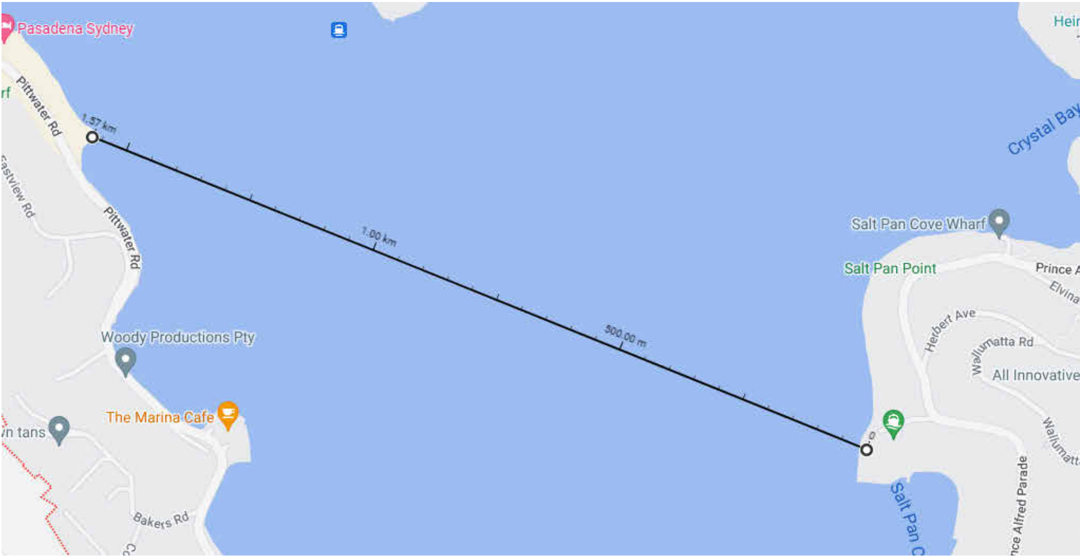
VISUAL IMPACT ANALYSIS - VIEW 05