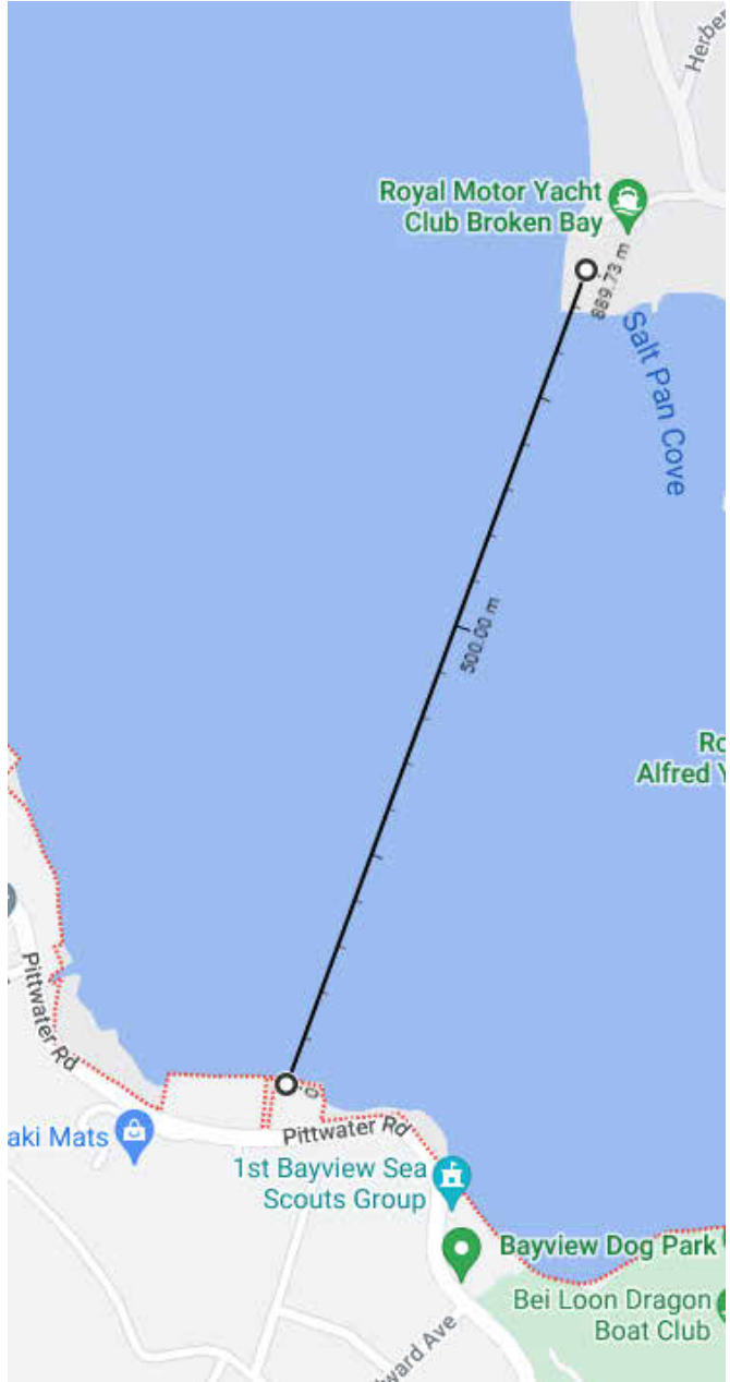
VISUAL IMPACT ANALYSIS - VIEW 01