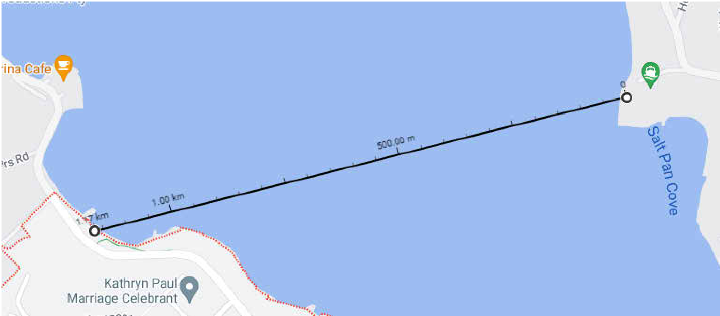
VISUAL IMPACT ANALYSIS - VIEW 04