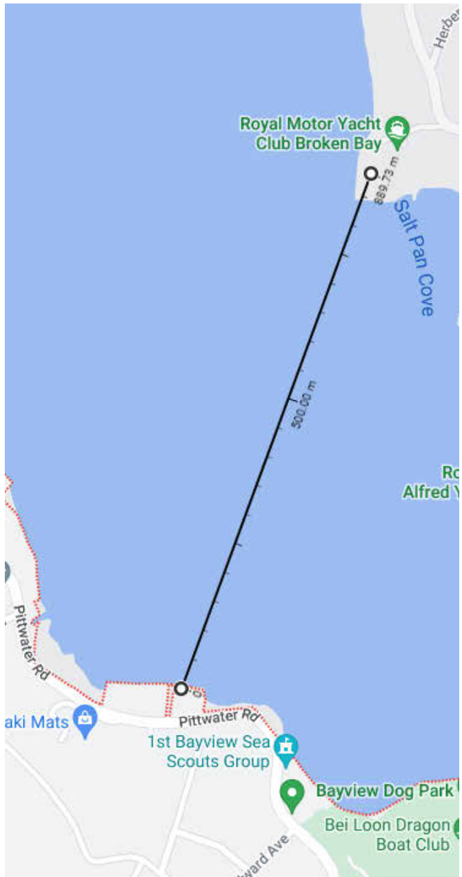
VISUAL IMPACT ANALYSIS - VIEW 02