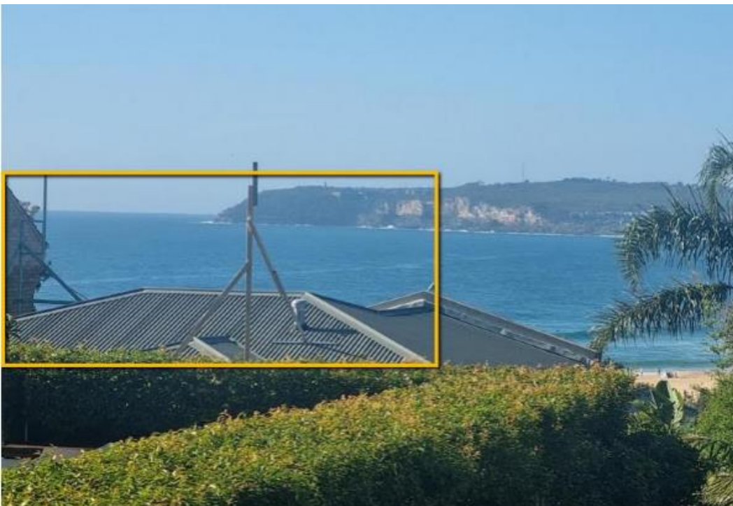
Photo showing loss of iconic views from balcony including height poles.

This view will be lost from our main living areas of our home including our Kitchen, dining room, lounge room and balcony.