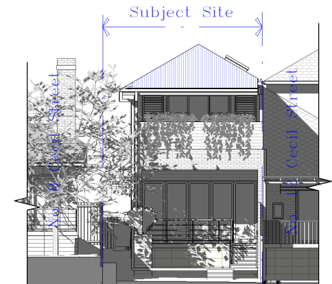
Proposed North Elevation - 1:200