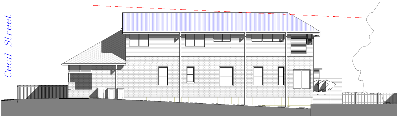
Proposed East Elevation - 1:200