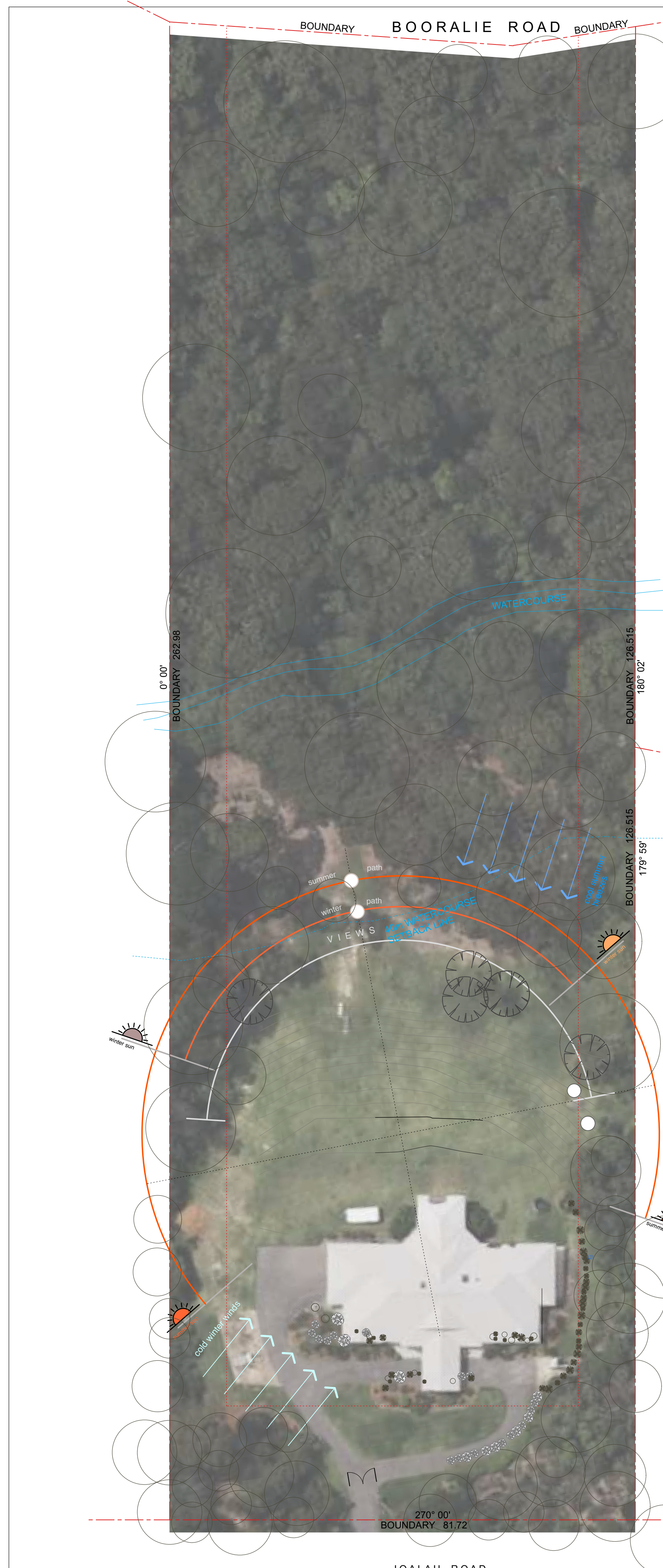
01 SITE ANALYSIS PLAN SCALE 1:500 REF