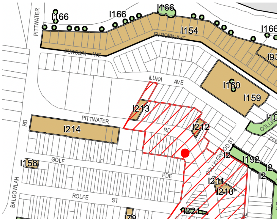
Figure 9: MLEP 2013 Heritage Map (location of the subject site denoted by red dot).

The subject site is not listed on Schedule 5 of the MLEP 2013 as a Heritage Item, but it is located within the Pittwater Road conservation area.