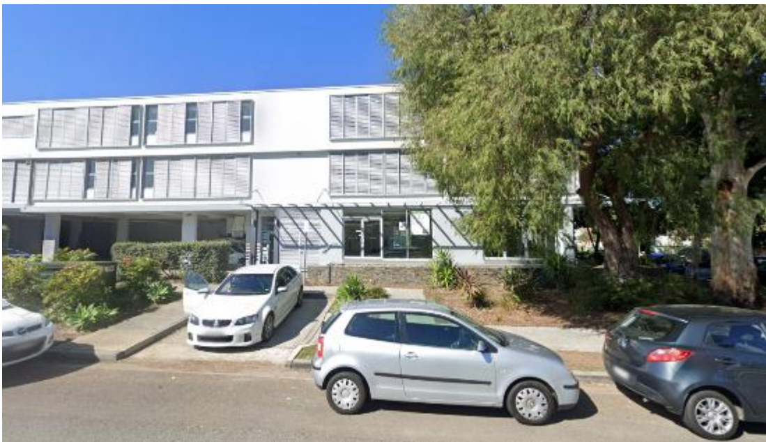
Figure 6: 3 storey shop top housing development at 9-11 Gondola Road (as seen from Verona Street)