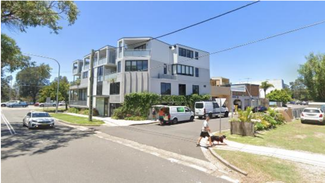
Figure 9: 4 storey shop top housing development at 1473 Pittwater Road

The 4 storey element of the proposal associated with the communal roof top area will not be readily perceived from the public domain and are entirely consistent with the development approved at 1 Gondola Road, North Narrabeen.