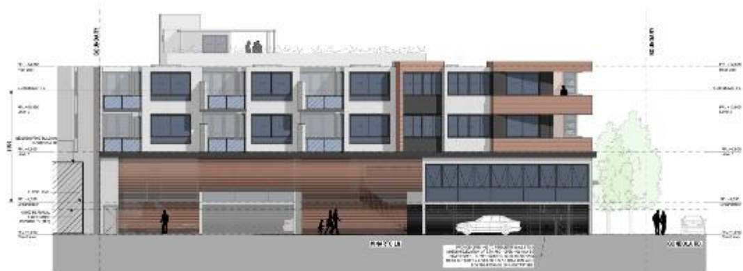
Figure 7: Approved 3 storey shop top housing development with roof top terrace at 1 Gondola Road