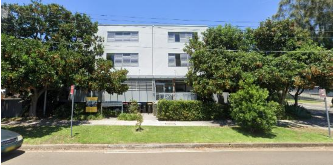
Figure 5: 3 storey shop top housing development at 9-11 Gondola Road