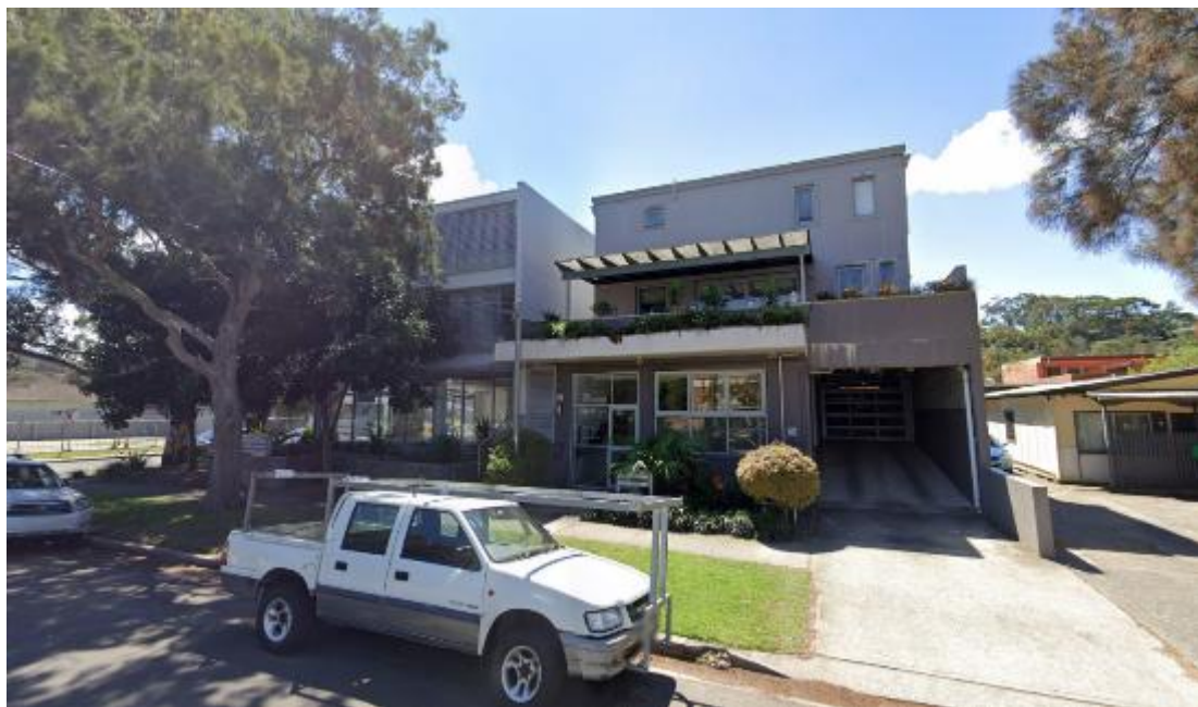
Figure 4: 3 storey shop top housing development at 10 Rickard Road