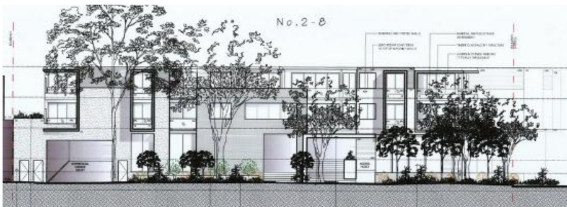
Figure 3: Extract of southern elevation of shop top housing development approved at 2-8 Rickard Road (N0276/16)