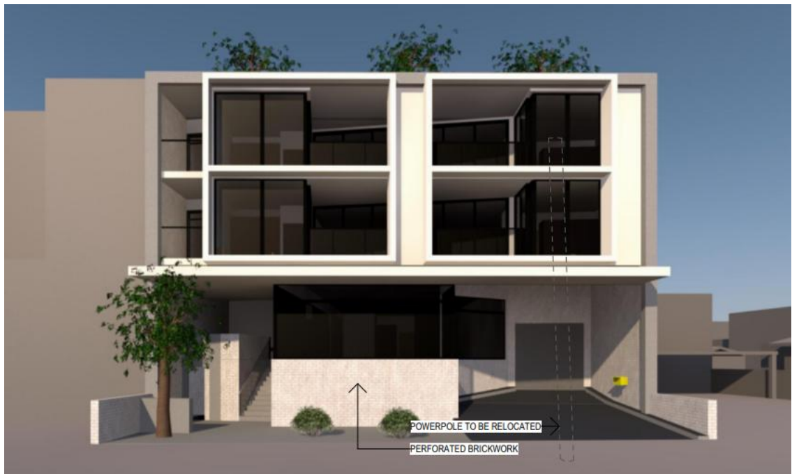
Figure 8: Approved 3 storey shop top housing development with roof top terrace at 3 Gondola Road