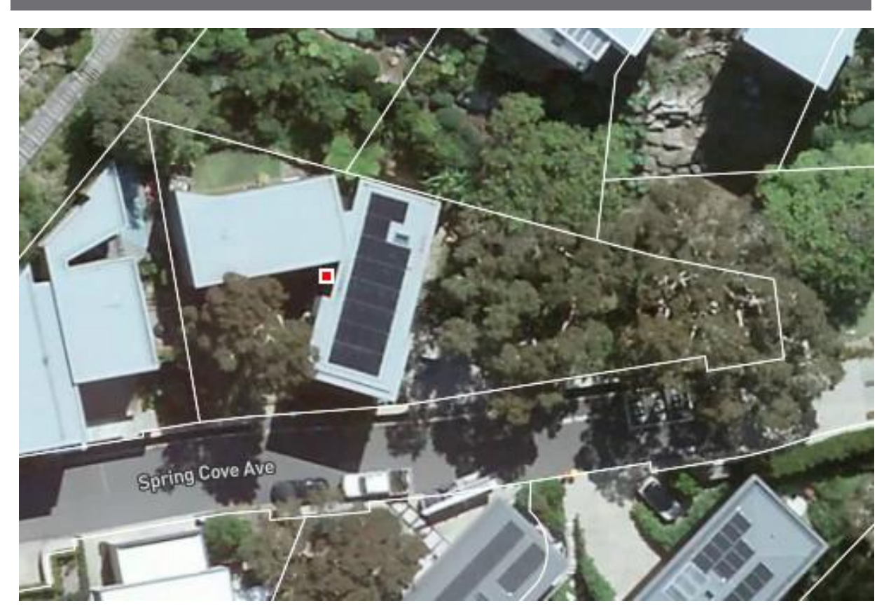
Figure 1: The subject site located by red marker ( property boundaries shown by white lines referenced from metromap 2022 ).