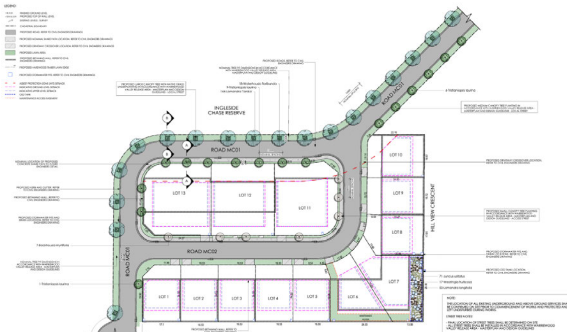
Figure 4: Proposed Public Domain Plan