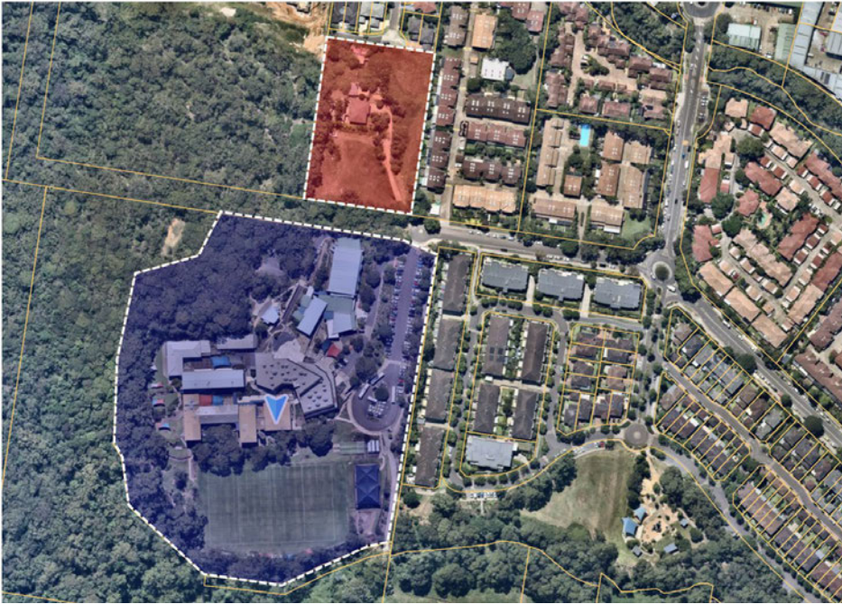
Figure 1 Mater Maria School Location (blue) proximate subject site (red)