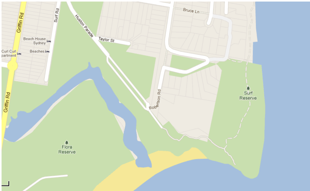
Fig 1: Location of Subject Site