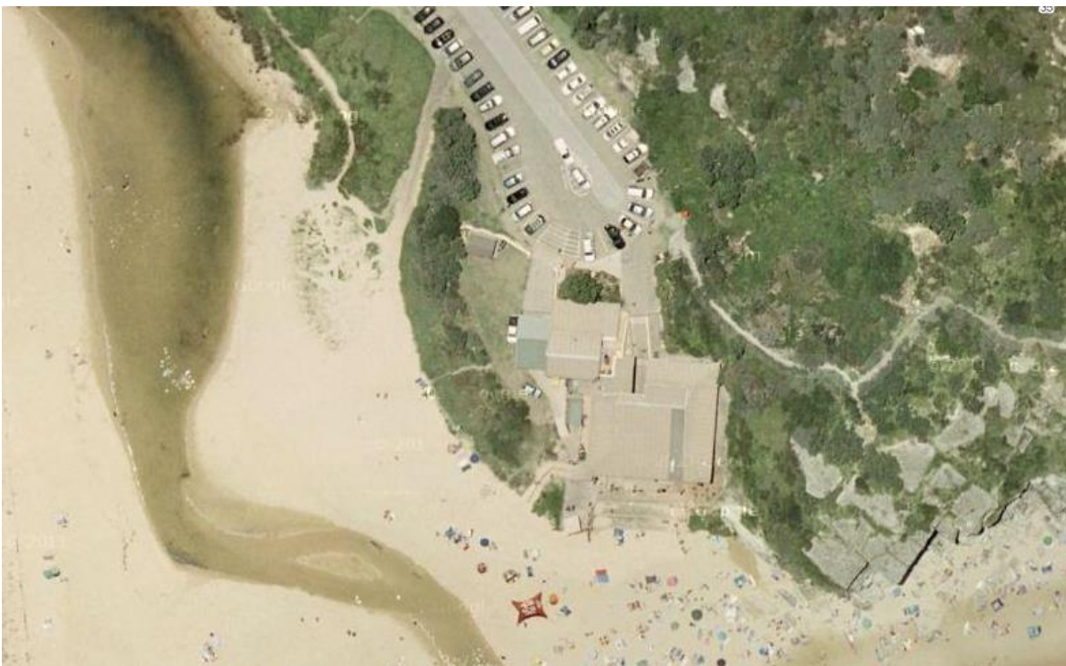
Fig 2: Aerial view of subject site