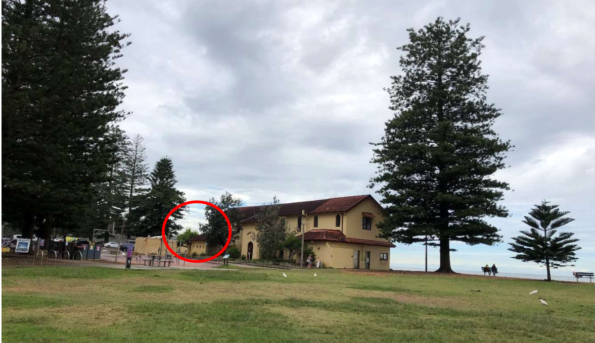
Figure 4 Location 6 View from Bert Payne Park with the location of the new extension circled in red