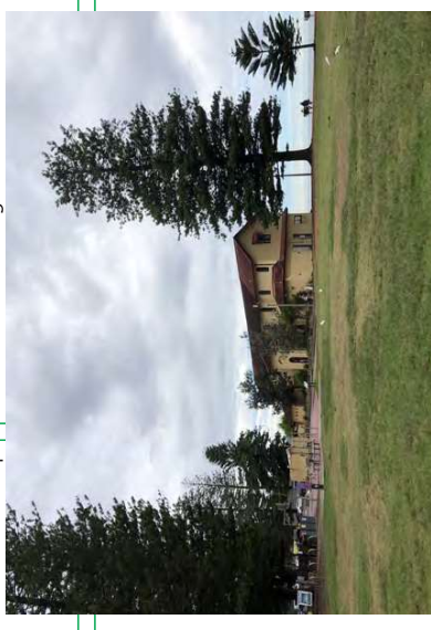
6. View from Bert Payne Park.