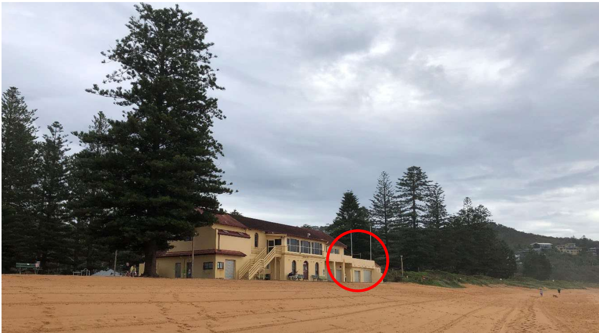
Figure 5 Location 7 View from Newport Beach opposite Bert Payne Park with the location of the new extension circled in red.