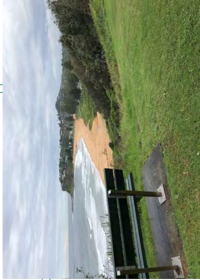
1. View looking south from Eric Green Public Reserve.