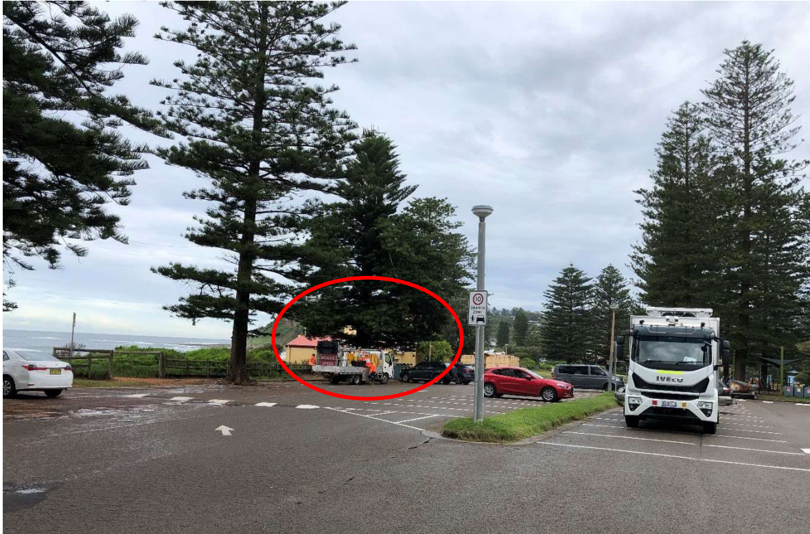
Figure 2 Location 3 from Newport Beach Carpark with location of the new extension identified by a red circle