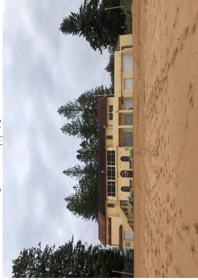
8. View from beach towards Newport SLSC.