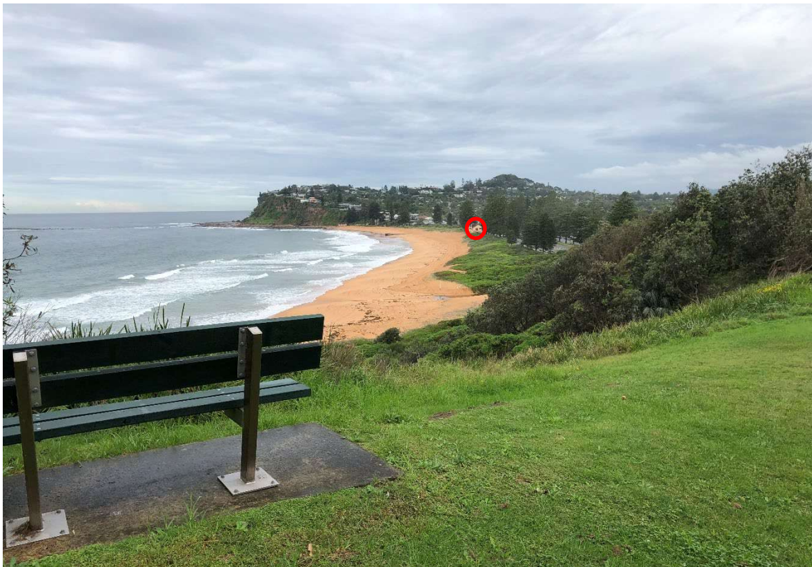
Figure 1 View from Eric Green Public Reserve with location of Newport SLSC identified in red.