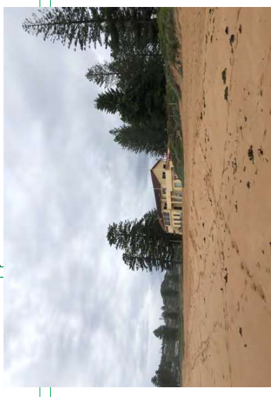
9. View from beach looking south towards Newport SLSC.