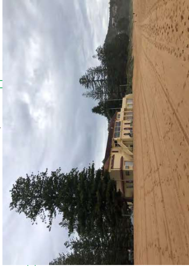
7. View from Newport Beach opposite Bert Payne Park.