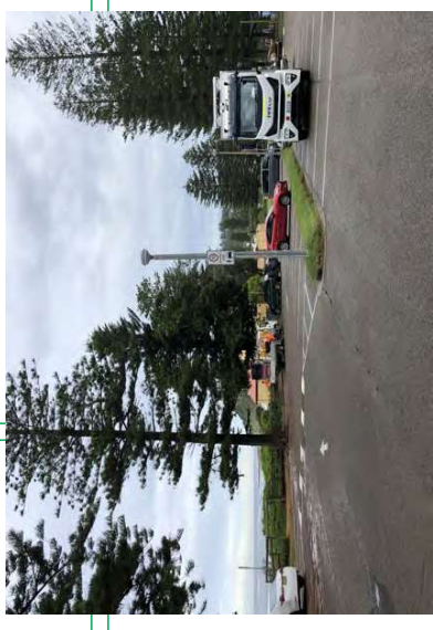
3. View from carpark towards SLSC building.