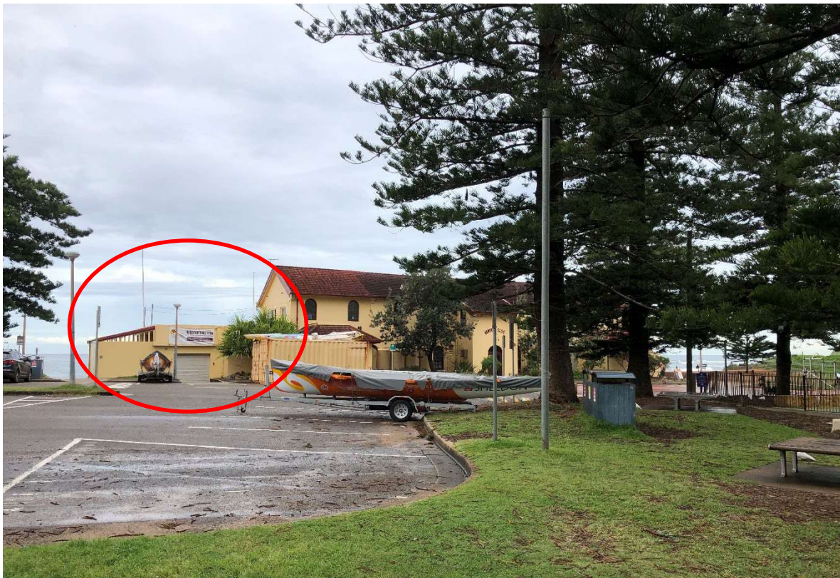
Figure 3 Location 4 from southern end of carpark with location of the new extension identified by a red circle. Removal of the shipping container will improve views of the Newport SLSC. The new addition does not obscure any public domain views towards Newport Beach