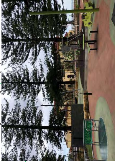
5. View from existing childrens playground area.