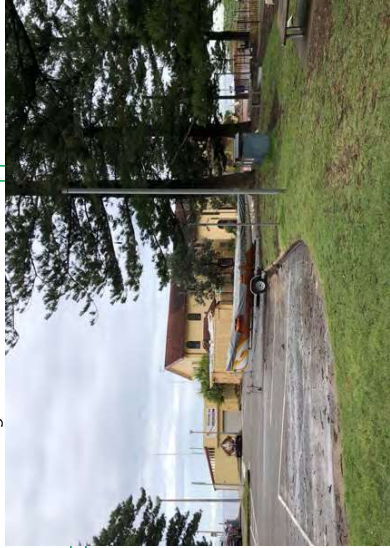
4. View from southern end of carpark.