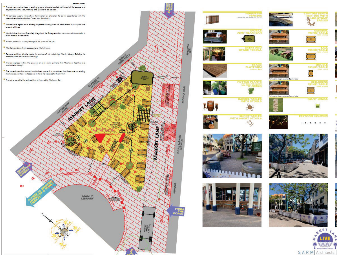
Image: Site layout concept in context with surrounding built form.