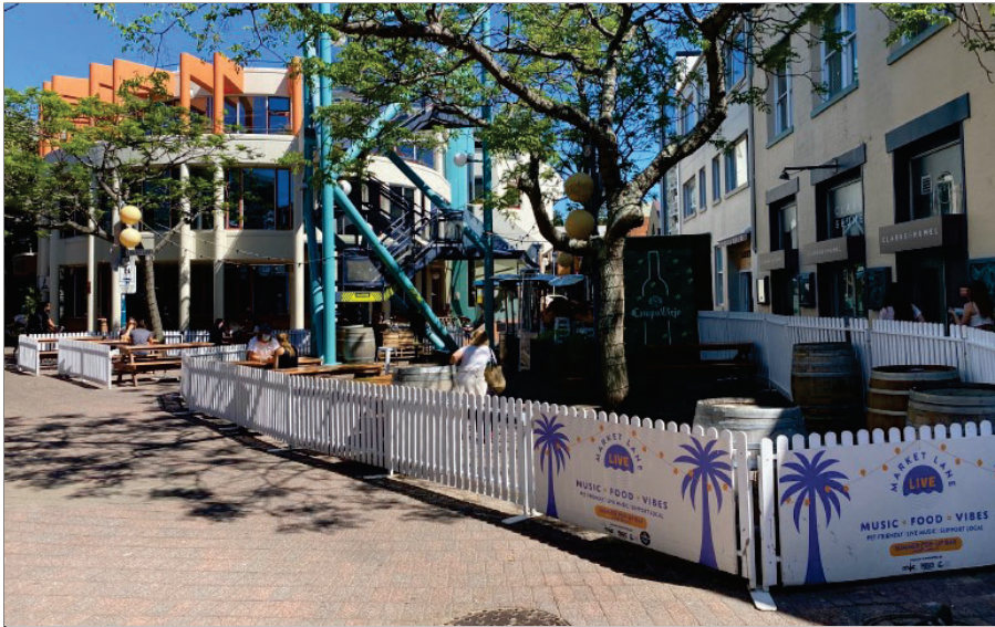
Image: Existing set-up of the small bar. The layout is to be adjusted as part of the current DA.

(Note: The capacity, layout and hours of operation has been revised / reduced from that in the Statement of Environmental Effects during the course of the DA assessment period in response to referral comments, submissions and operational considerations by the Applicant as part of the application process.)