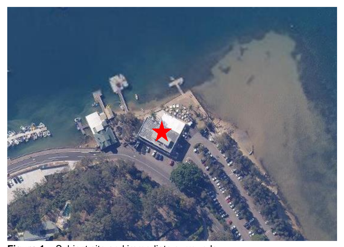
Figure 1 – Subject site and immediate surrounds

The proposed works are located on Lot 142, DP 752046, No. 1858 Pittwater Road Church Point. The site is occupied by a 3 storey mixed use building known as Pasadena which operates pursuant to the 1961 development consent and subsequent 1963 building approval. The site and its immediate surrounds are depicted in Figure 1 below.