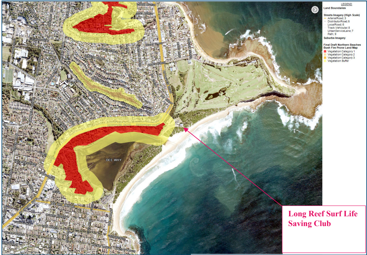
Figure 1 Location of Long Reef SLSC on bushfire prone land map

buffer zone. Figure 3 depicts the proposed site plan for building works, relative to the bushfire buffer zone.