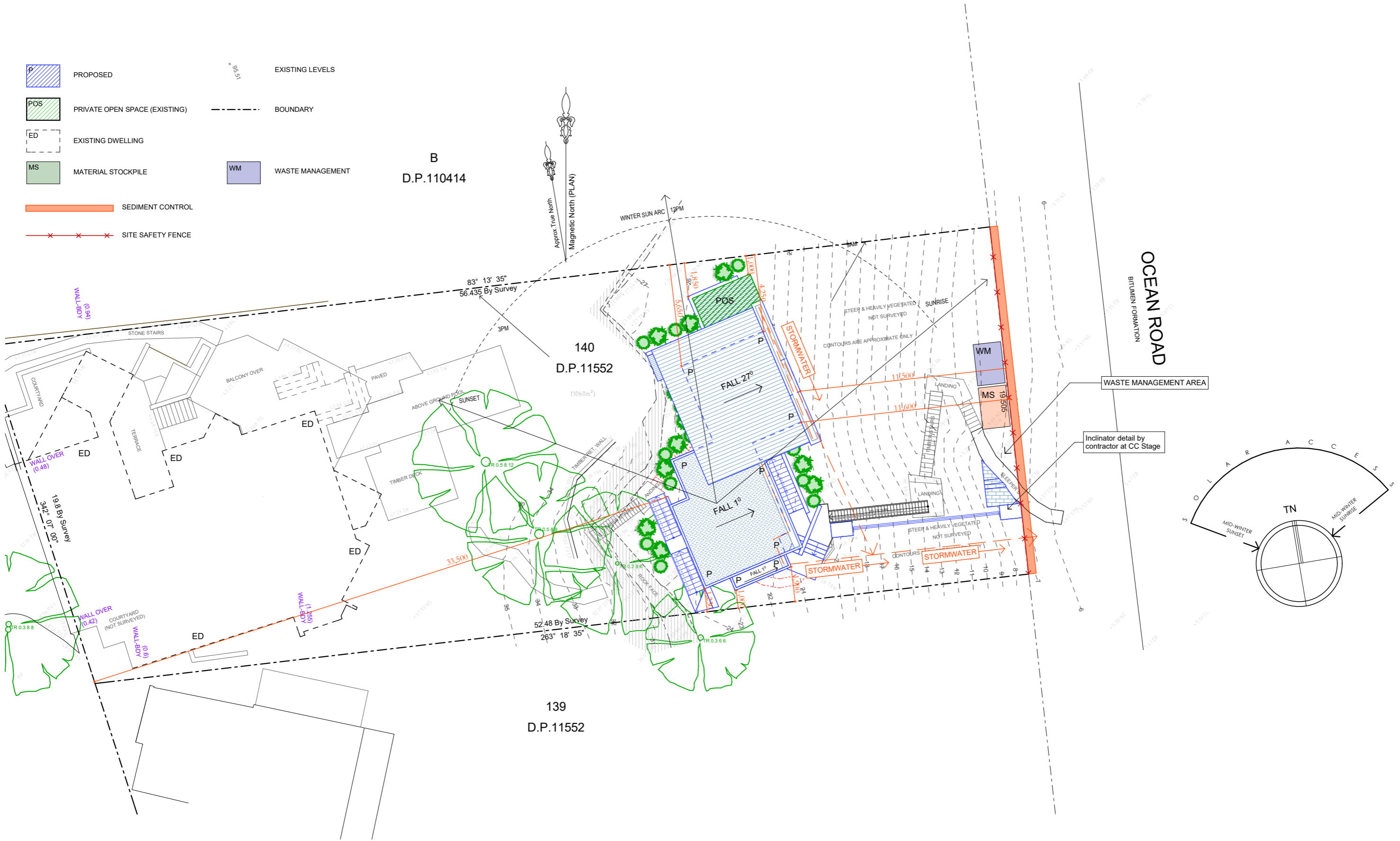
Site, Site Analysis & Waste Management & Stormwater Concept Plan 1:200