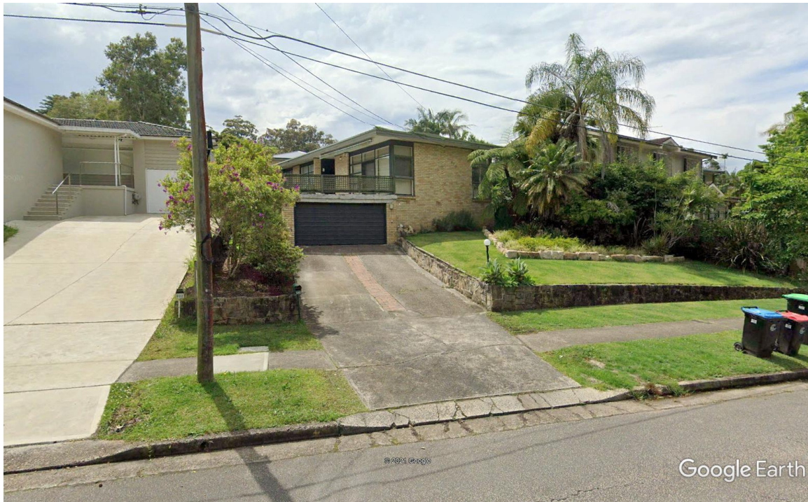
View of southern adjoining property

The adjoining dwelling is well distant from the subject dwelling having its driveway situated along its northern boundary common with the subject site. The proposed upper level addition on the subject site will maintain a substantial separation from this adjoining dwelling.