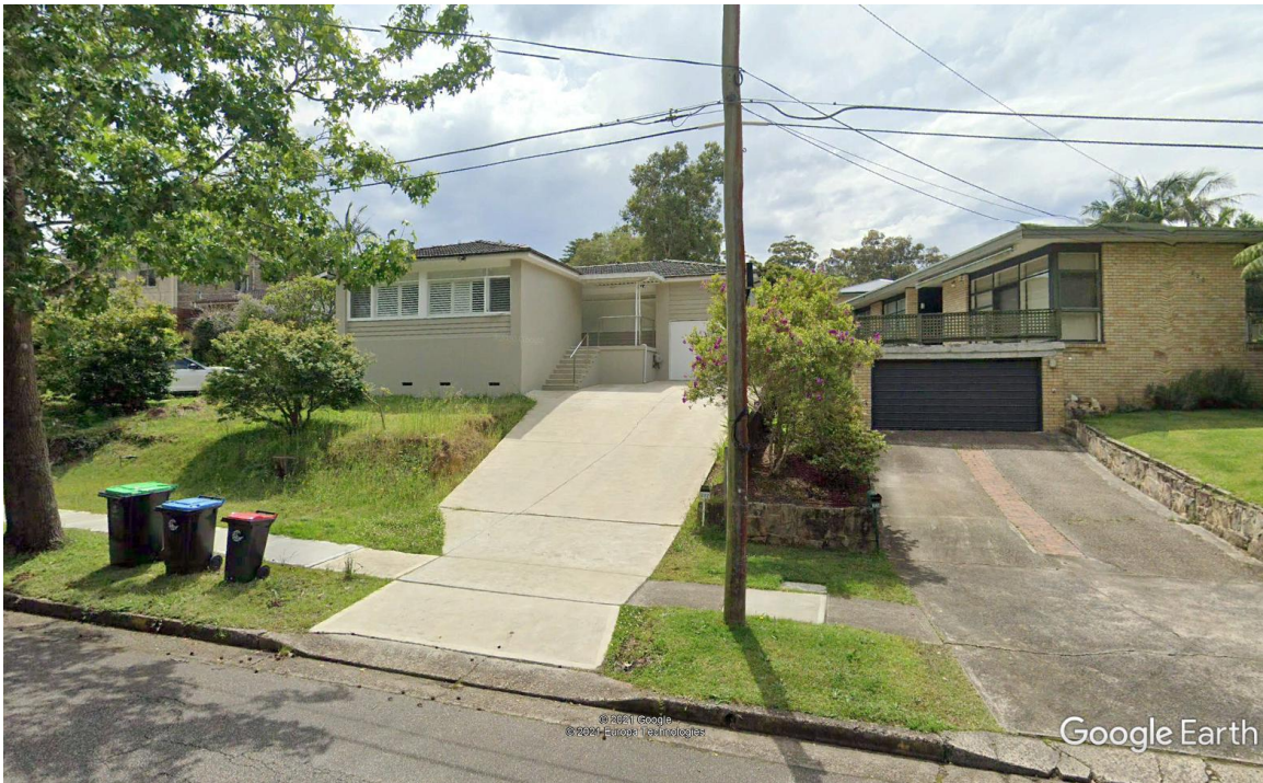
View of the existing dwelling from.

The building is not listed under the Warringah Local Environmental Plan 2011 as having any heritage significance nor is it in the immediate vicinity of any items of heritage significance.