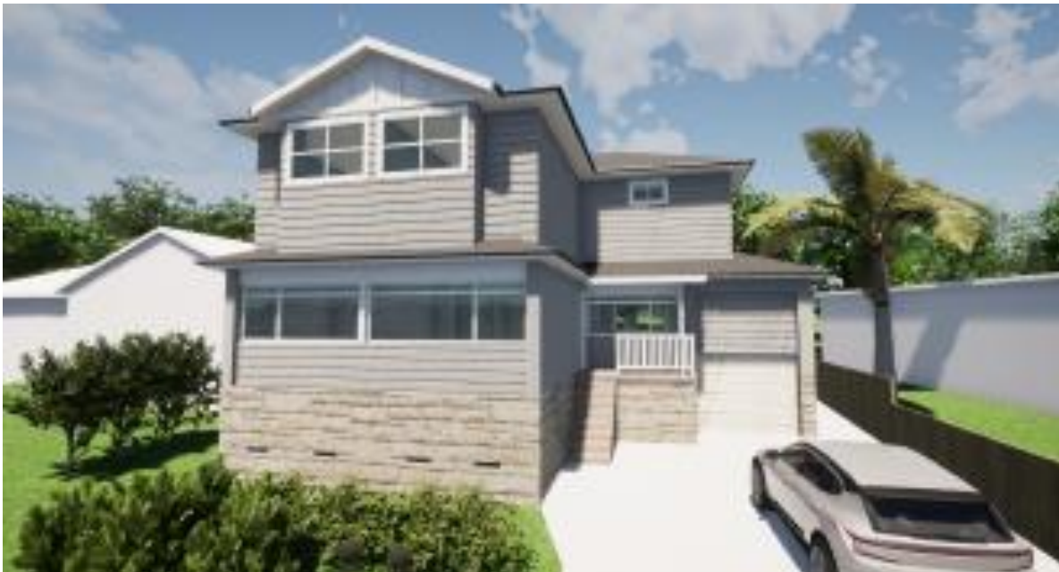
Proposed Streetscape elevation