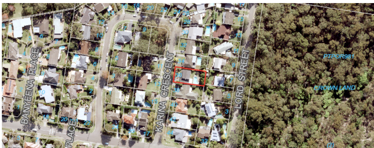
Image 2: Site location 36 Karina Crescent, Belrose – Red Polygon