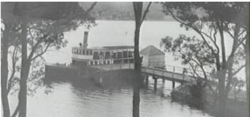
Figure 5: The Phoenix at Newport Public Wharf, 1925