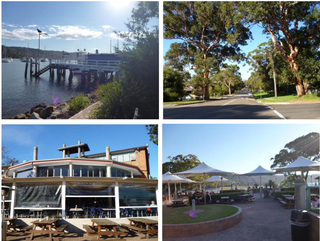
Figure 3: Clockwise from top left: The Newport Wharf to the north of the site which is identified as a maritime archaeological site, a tree lined residential street close to the subject site, a view of the western elevation of the hotel building from the external dining area, and a view of the external dining and the beer garden area looking over Pittwater.