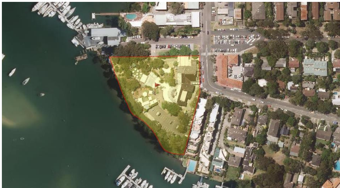
Figure 2: Aerial view of the subject site, outlined in red.