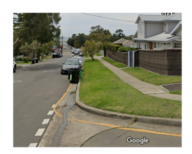
Figure 3 | Anzac Ave