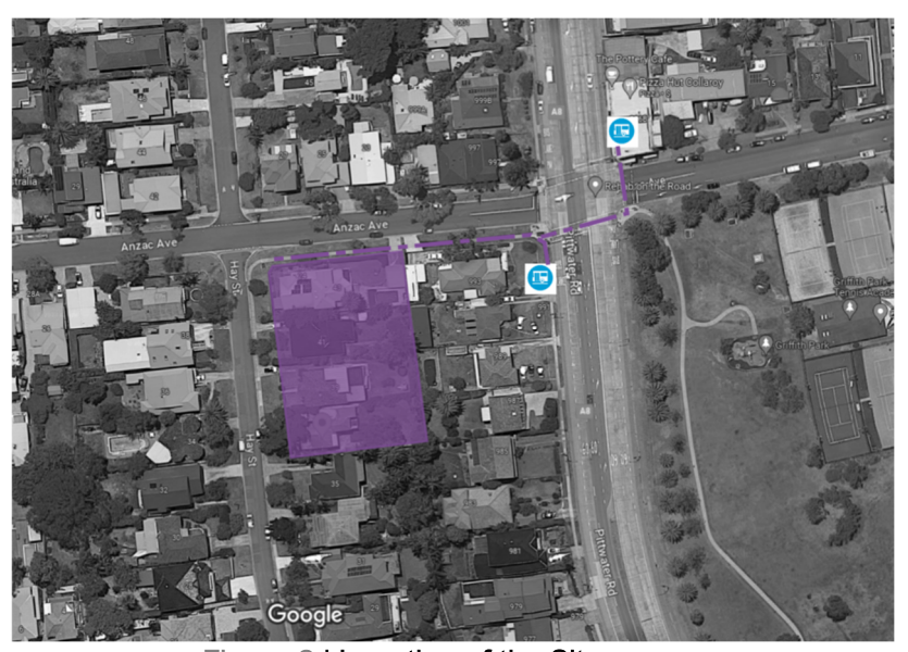
Figure 2 | Location of the Site

Pittwater Rd at Anzac Avenue Stop ID: 209725