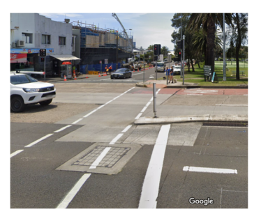
Figure 5 | Road Crossing