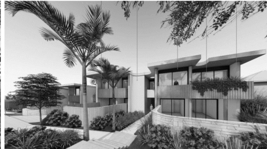
Figure 1 | Proposed Development