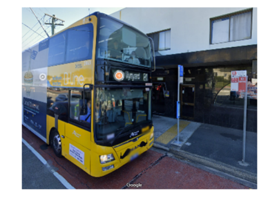
Figure 6 | Bus Stop