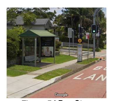
Figure 5 | Bus Stop