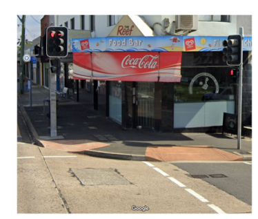
Figure 6 | Kerb Ramps